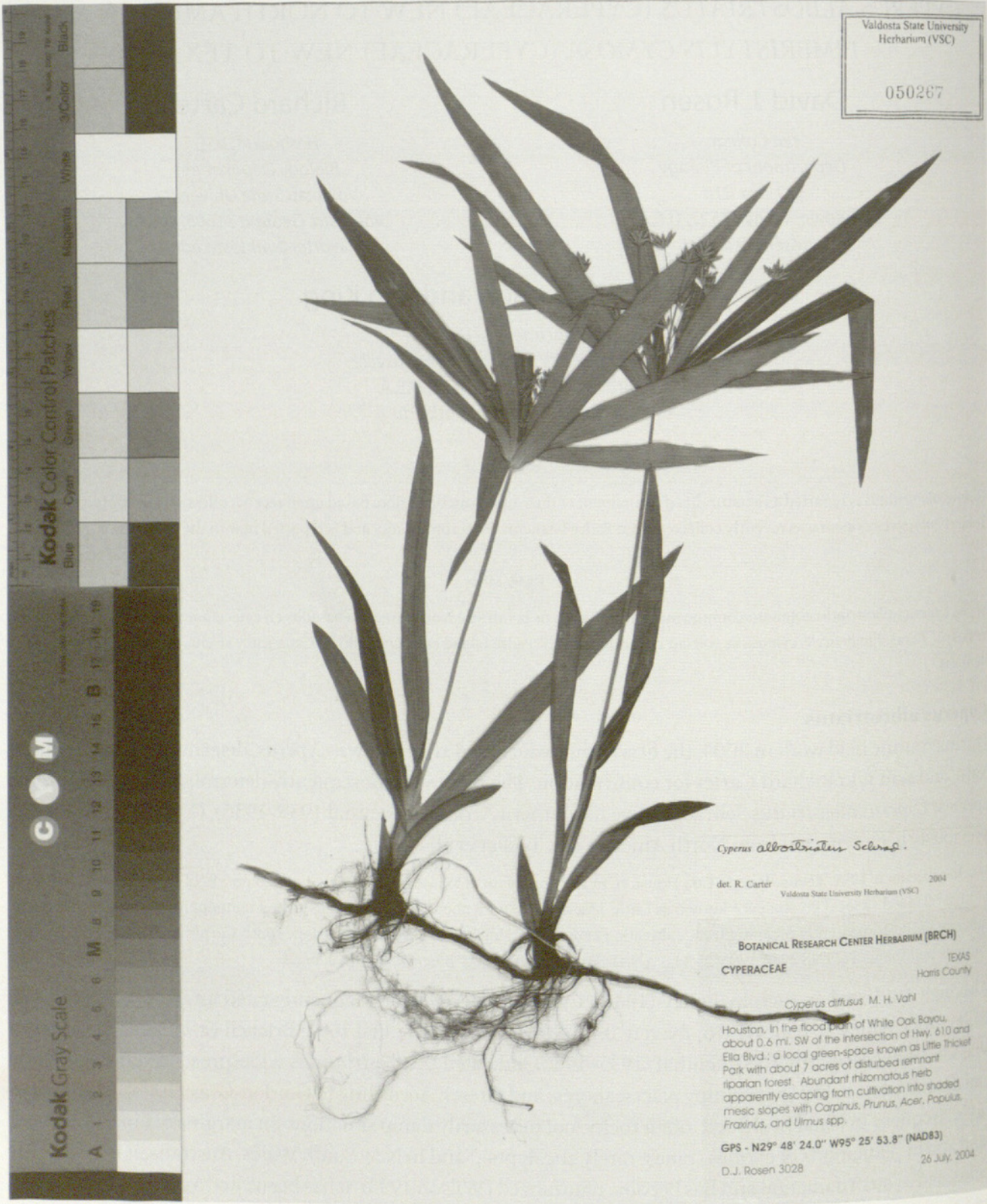
Fig. 1. Cyperus albostratus Schrad. (Rosen 3028—VSC 0006337)

spread species known from seaside and coastal habitats in the United States (Florida), southern Mexico, Central America, South America, Africa, Asia, Australia, and Islands in the Indian and Pacific Oceans (Kral 2002). Fimbristylis cymosa is quite distinct from other Texas perennial Fimbristylis in its dense rosette of stiff, spreading excurved leaves and compact cluster of spikelets forming a corymbose head-like inflorescence. Koyama (1985) treated Ceylonese plants as F. cymosa subsp. spathacea (Roth) T. Koyama based on the presence