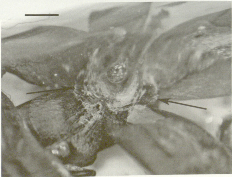
FIG. 2. Swietenia dominicensis . Basal view of flower with pedicel in center. Arrows indicate 2 of 3 sepal lobes in focus. Sepal lobes ciliate-margined, petals glabrous-margined. Scale bar = 0.45 mm.