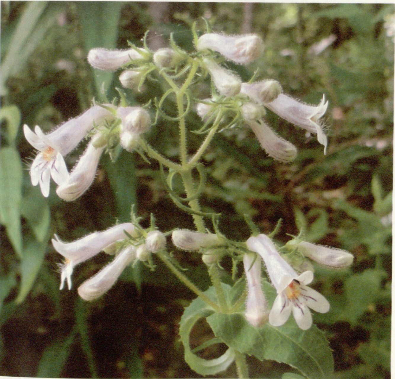
FIG. 2. Inflorescence of Penstemon kralii , Franklin County, Tennessee (based on Estes 11,901 with York & Gorman APSC, TENN. ). Photo taken by Dawn York, 4 May 2011.

ing to a narrowly attenuate petiole-like base, medial lanceolate or oblong, those just proximal to the inflorescence ovate-lanceolate, medial blades 12–15 cm \times 3–4 cm, usually larger than proximal and distal cauline leaves, apex acute to acuminate, margins sharply and coarsely serrate with mostly 4–7 acuminate teeth per cm (fewer on proximal leaves), base subcordate to rounded and clasping (proximal leaves tapered to a narrowly clasping base); blades dark green, abaxial surface glabrate or those toward inflorescence moderately pubescent; adaxial surface with scattered, eglandular, straight, sharp-tipped white hairs 0.1–0.3 mm, especially near midvein, otherwise glabrate. Inflorescence a terminal thyrses, 5–20 cm \times 3–12 cm, bracts at base of inflorescence 3–6(–8) cm \times 0.7–3 cm, half to sometimes equaling the distalmost non-bracteal stem leaves, primary inflorescence bracts narrowly lanceolate with dilated bases, secondary inflorescence bracts narrowly lanceolate to linear, sometimes abruptly dilated at base; inflorescence glandular-capitate. Flowers slightly nodding; pedicels 1.5–4 mm, pubescent with glandular-capitate hairs. Calyx campanulate with 5 subequal sepals; these distinct nearly to base, lance-attenuate and becoming strongly recurved, green with thin hyaline margins proximal to middle, 4–5.5 mm \times 1 mm, abaxial surface and margins moderately covered with gland-tipped