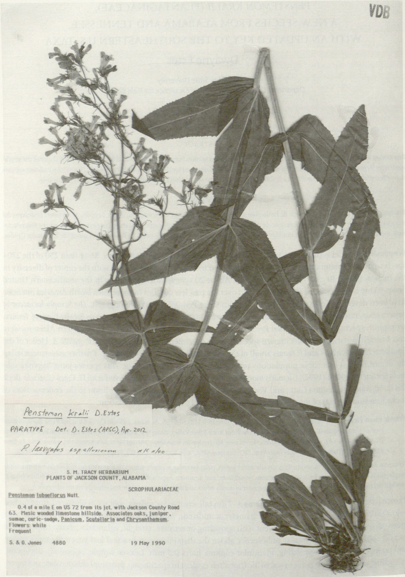
Fig. 1. Paratype of Penstemon kralii from Jackson Co., Alabama (S. & G. Jones 4880 VDB).