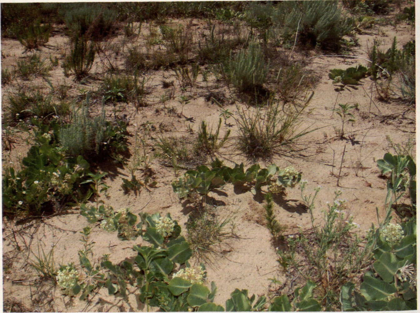
FIG. 4. Dalea cylindriceps in Artemisia filifolia community, Cheyenne County, Colorado.

Dalea cylindriceps has been collected (to a lesser extent) in other sandy-gravelly habitat, notably the alluvial deposits of streams and colluvium derived from sandstone outcrops and escarpments. The mostly herbaceous plant communities that develop in such habitat occur as small patches or bands of vegetation in the landscape.