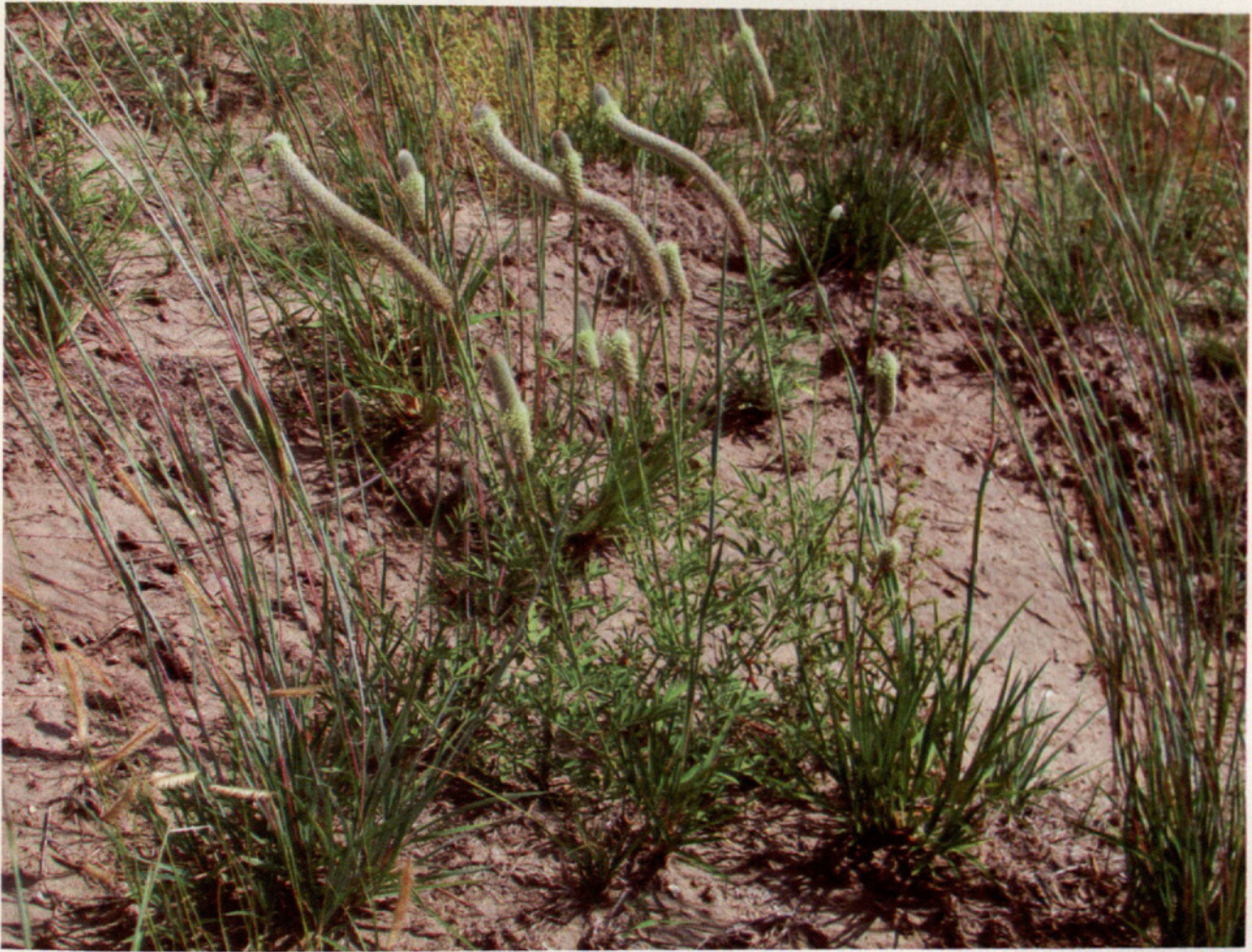
FIG. 2. Dalea cylindriceps , Sheridan County, Nebraska.