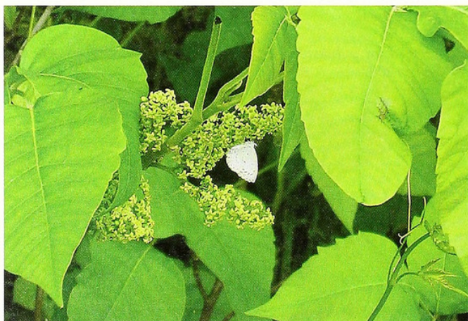
Fig. 1. Celastrina neglecta nectaring at an inflorescence of poison ivy ( Toxicodendron radicans ) on June 8, 2005.