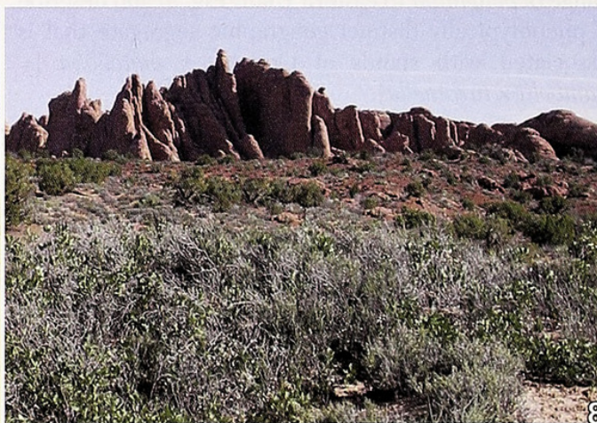
FIGS. 7–8. Habitat of Catocala benjamini ute . (7) JWP hanging bait trap at type locality: the low-lying green shrubbery at JWP's feet is the presumed host oak, Quercus x pauciloba . (8) Typical canyonlands habitat in Arches National Park, Moab, Utah.