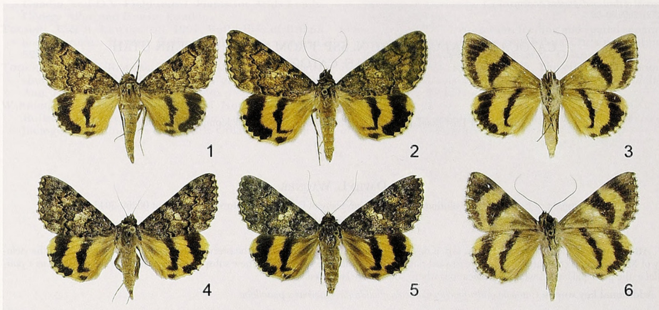
FIGS. 1–6. Catocala benjamini adults. (1) Catocala benjamini ute holotype male, Arches Natl. Park, Grand Co., UT. (2) Catocala benjamini ute female, SR 313, Grand Co., UT. (3) Catocala benjamini ute male venter, Arches Natl. Park, Grand Co., UT. (4) Catocala benjamini benjamini male, Hualapai Mtn. Rd., Mohave Co., AZ. (5) Catocala benjamini benjamini female, near Payson, Gila Co., AZ. (6) Catocala benjamini benjamini male venter, near Payson, Gila Co., AZ.

with dark scales absent or sparse (compare Figs. 2 and 5).