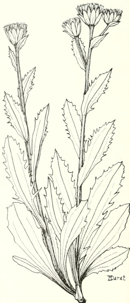
Fig. 1. Representative, but somewhat stout, specimen of H. alpinus ; drawn largely from Goodrich 12233 (FSU).

Additional specimens examined: Nevada, Lander Co., peak between Aiken and Carlin Creek, S. Goodrich 12137 (FSU, UTC); Nye Co., type locality, S. Goodrich 12126 (FSU, NY, UTC), head of left fork San Juan Creek, S. Goodrich 11997 (BRY, UTC), S. Goodrich 12006 (FSU, UTC), McLeod Creek, S. Goodrich 13437 (BRY, FSU), crest between T