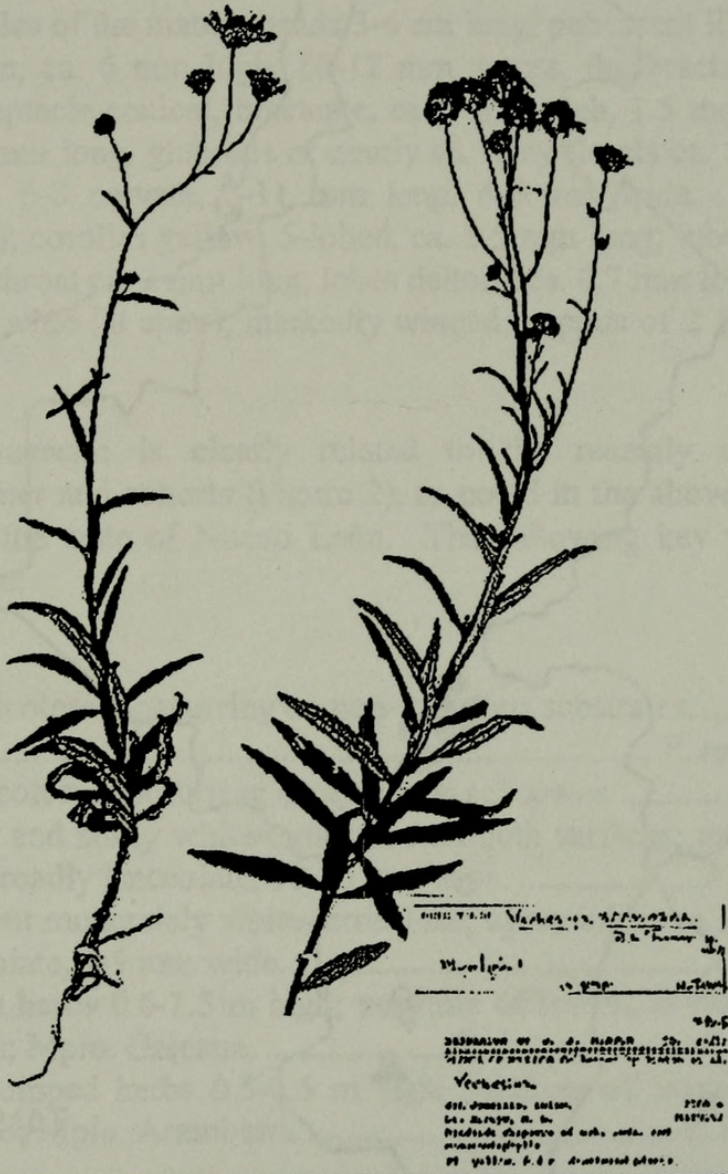
Fig.1 Verbesina arroyoana (holotype)