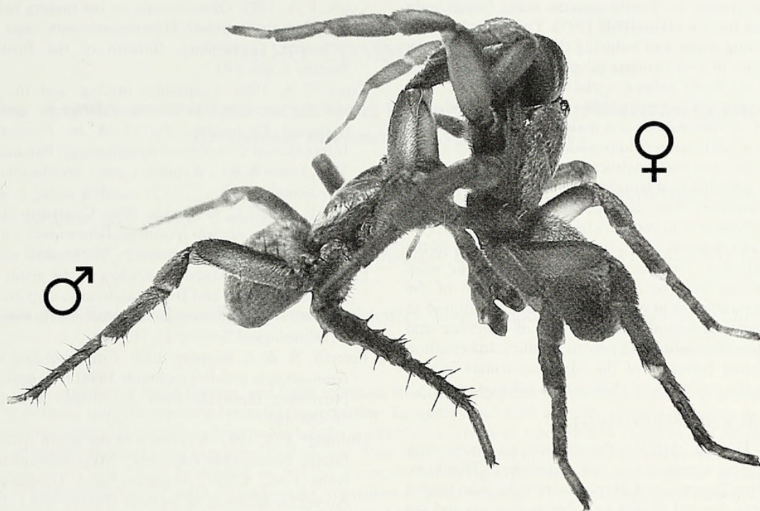
Figure 2.— Acanthogonatus centralis mating. Male clamping the female fangs with legs I, pulling with legs II, and inserting the embolus into the female genital opening.