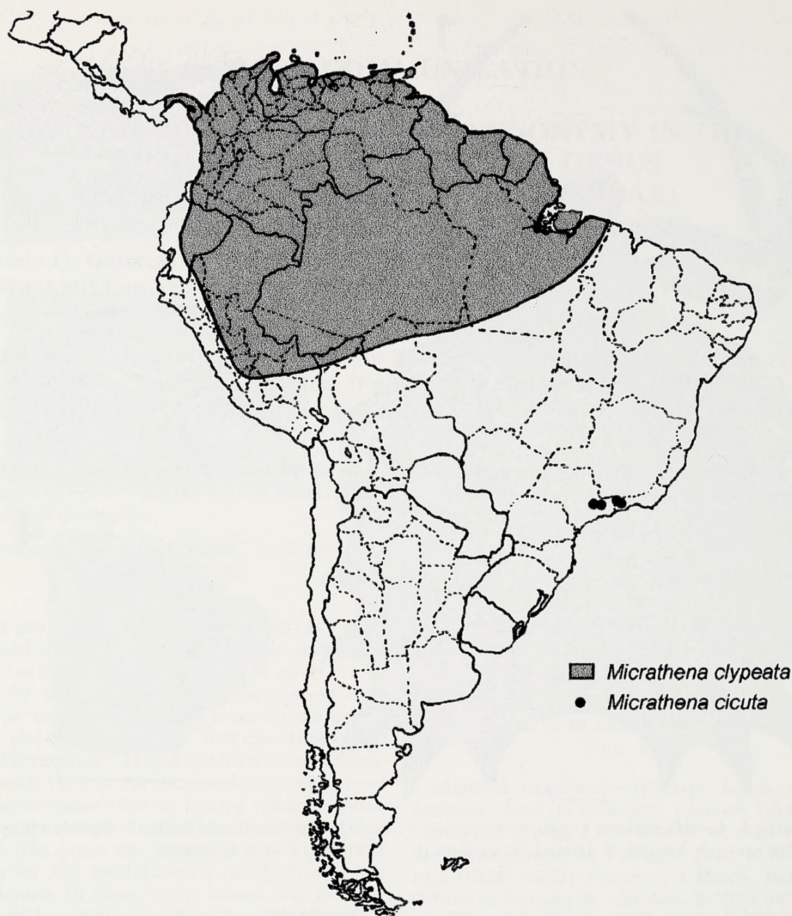
Figure 5.—Geographic distribution of Micrathena clypeata (gray area, based on records from Levi 1985) and locality records for Micrathena cicuta new species (circles).

by Levi (1985), and the type specimens are lost like so many of the species described by Walckenaer (1842). According to the original description (Walckenaer 1842:174), M. degeeri possesses an oval-triangular abdomen with 12 spines: an anterior pair of small ones (described as “médiocre” by the author), a pair of large and diverging posterior spines with two small ones on the base, one dorsal and one ventral. The sides of the abdomen were described as bearing two small spines. This description matches Levi’s (1985) illustrations of Micrathena plana , a species distributed from Panama and the West Indies to Argentina, and the only species with 12 abdominal spines recorded from Suriname.