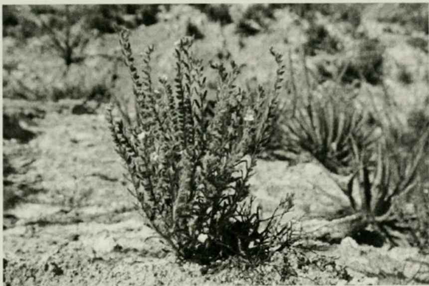
Fig. 1. Cryptantha geohintonii , growing in the field.