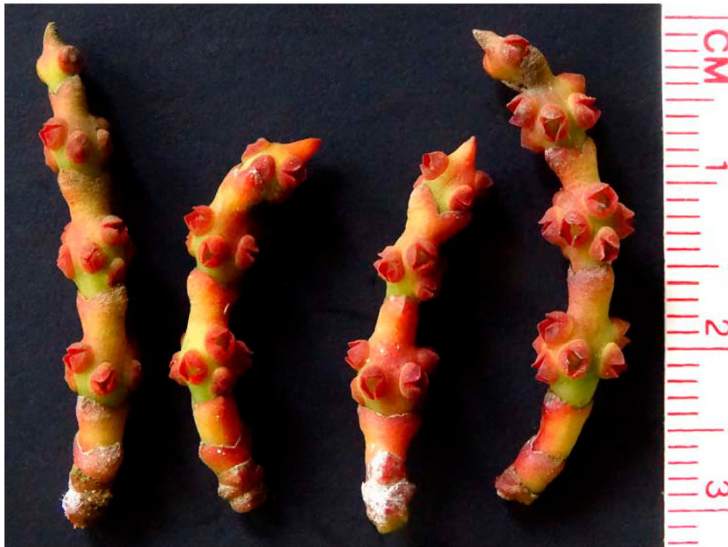
Fig. 2. Dendrophthora primaria , female inflorescences. Harrison & Harrison 638 (UCH).