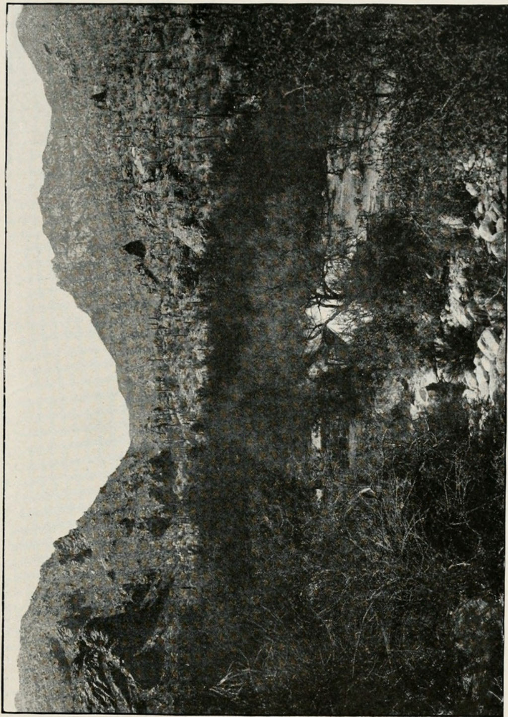
We "pitched camp . . . under large palo verdes and mesquites"