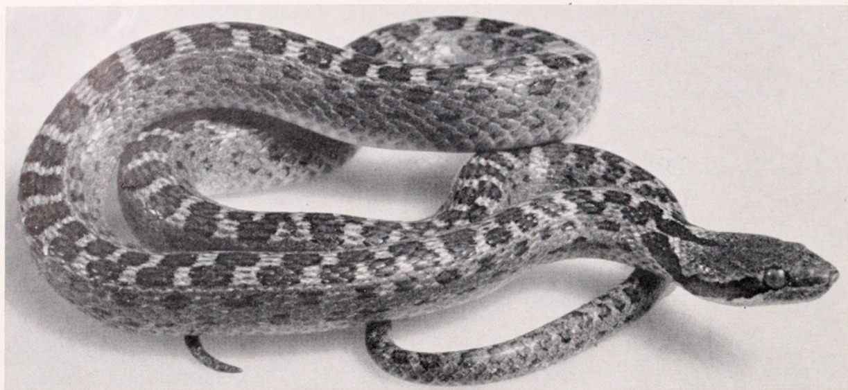
Fig. 1. The type specimen (SDSNH 44680) of Hypsiglena torquata catalinae .