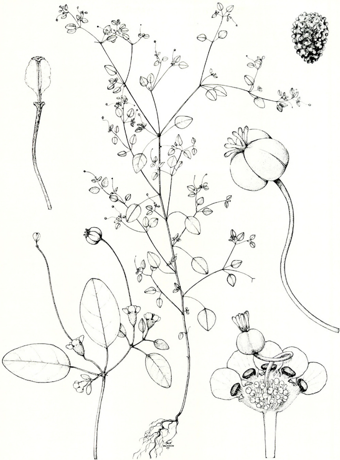
FIG. 3. Euphorbia rzedowskii (all from the holotype). Habit, \times 0.5 ; portion of flowering and fruiting tip of a branch, \times 5 ; cyathium, laid open, \times 15 ; fruit, \times 15 , including distal portion of gynophore; seed, \times 20 ; columella after fall of capsule, \times 15 .