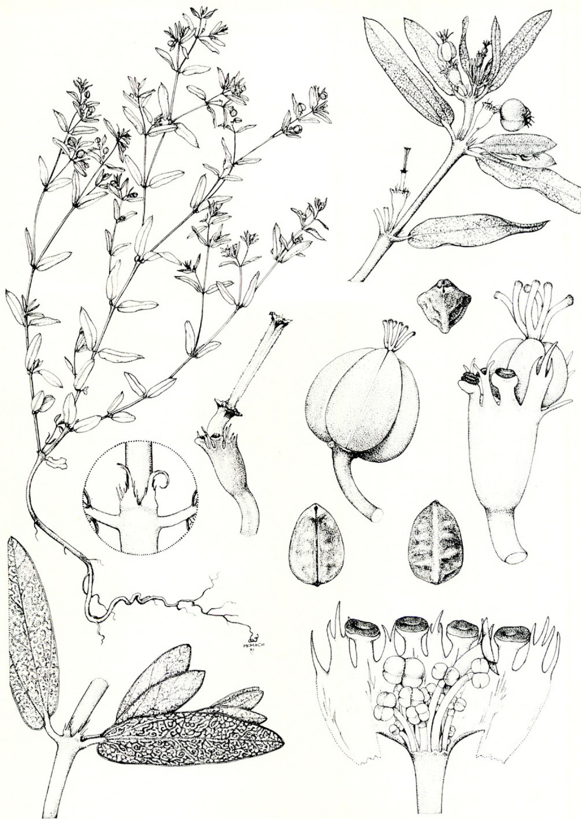
FIG. 1. Chamaesyce salsuginosa . Habit, \times 1 ; tip of flowering branch, \times 5 ; cauline node, \times 10 ; node with leaves showing venation, \times 5 (all from Dieterle 3463 ); cyathium at anthesis, and the same laid open, both \times 30 ; capsule, seed in 3 views, and columella after dehiscence of capsule, all \times 15 (all from the holotype).