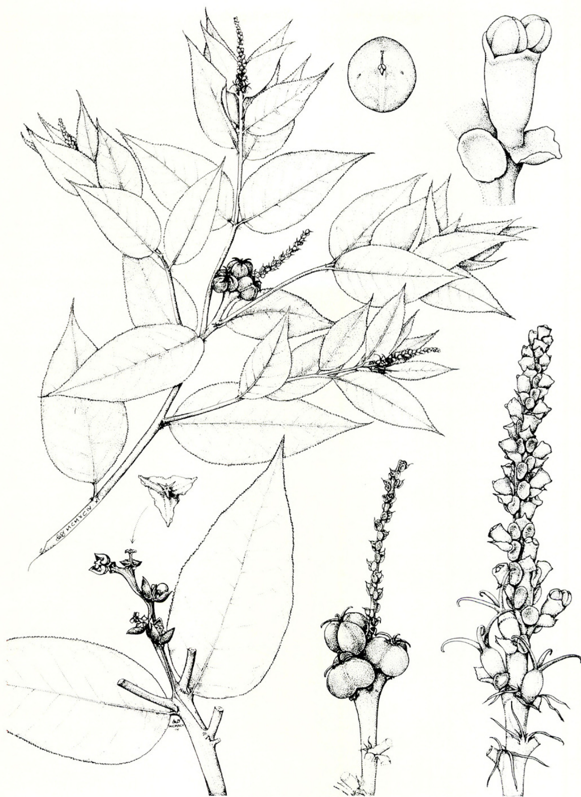
FIG. 5. Stillingia pietatis (all from an isotype, MICH). Flowering branch with young capsules, \times 0.5 ; seed, \times 3 ; bract in \delta part of inflorescence, \times 7.5 , turned back in early anthesis showing solitary stipitate flower with 2 anthers extruded from the calyx; inflorescence at anthesis (lower right), \times 2.5 , with most \delta flowers still in bud; inflorescence with nearly mature capsules and filiform persistent styles, \times 1 , the distal part of the \delta spike missing; \eta portion of spike after dehiscence of capsules, \times 0.5 ; apical view of gynobase from terminal node of \eta spike, \times 1.5 .