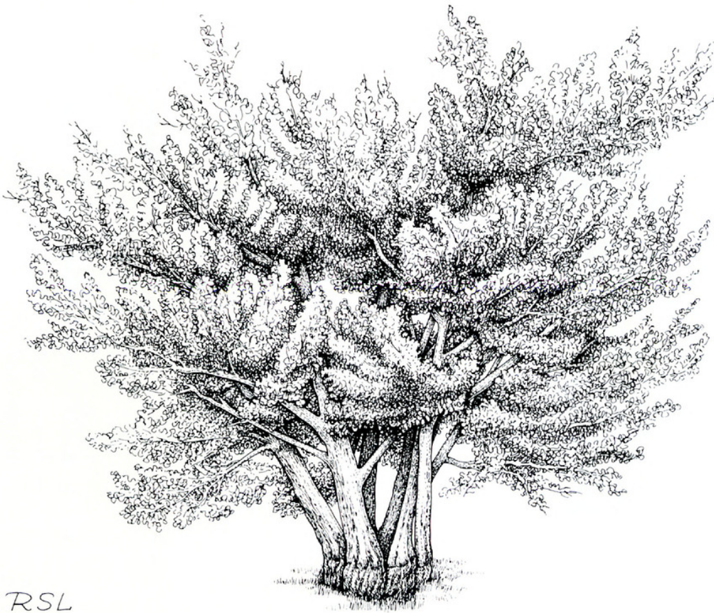
FIGURE 1. Cercidiphyllum japonicum : habit drawing of one of the old carpellate trees growing in the Arnold Arboretum. This tree (AA #882-B) was grown from seed received at the Arnold Arboretum on April 29, 1878, that had been collected by Professor W. S. Clark in Hokkaido, Japan. Approximately 100 years old, this specimen is about 10 meters (35 feet) in height and illustrates the multiple trunks developed by many individuals of the species.

Large trees to 20 or 25 m., occasionally to 35 m., with grayish black or grayish brown, deeply furrowed, and spirally twisted bark even when