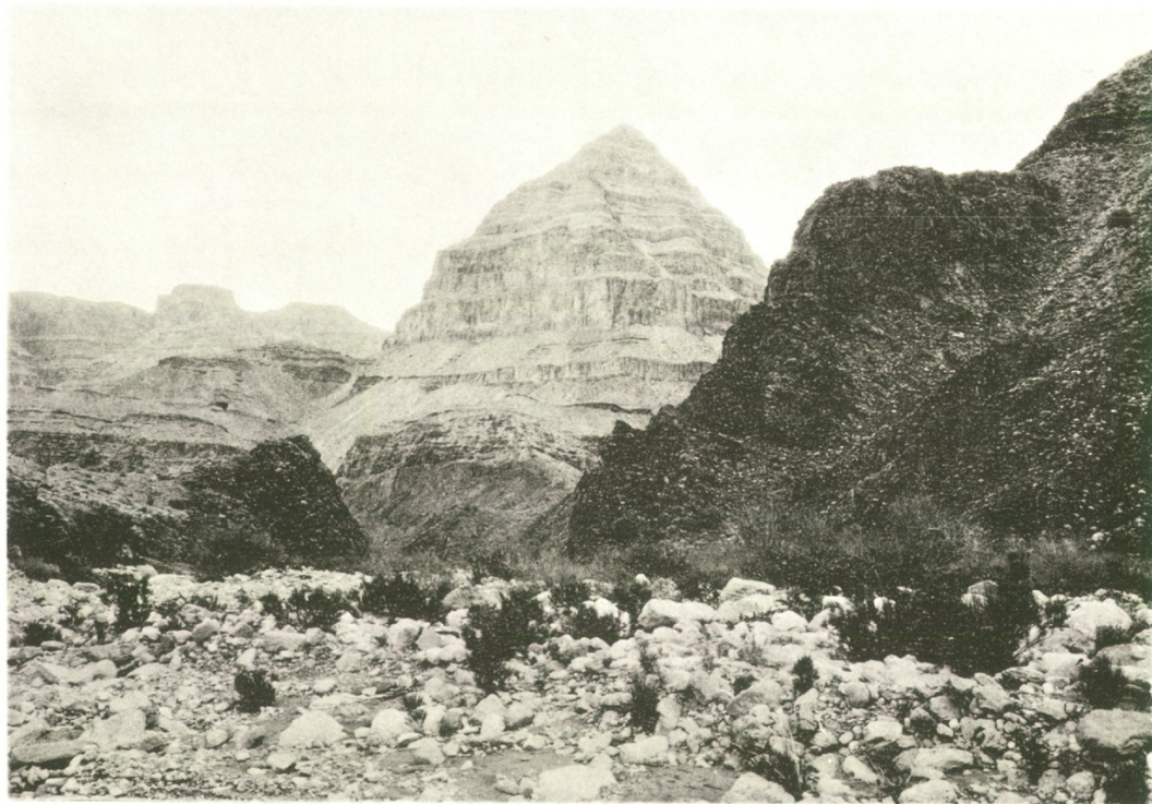
VIEW NORTH SHOWING DIAMOND PEAK, BEYOND FLOWS THE COLORADO