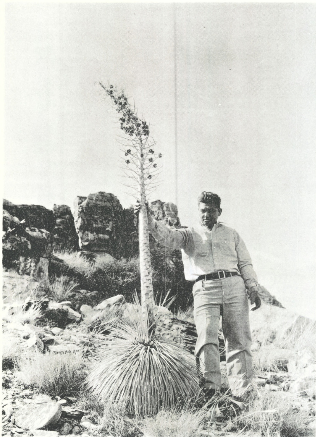
MATURE PLANT OF YUCCA WHIPPLEI