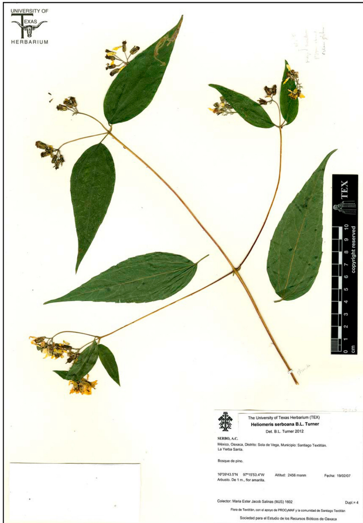
Fig. 1. Heliomeris serboana (Isotype: TEX).