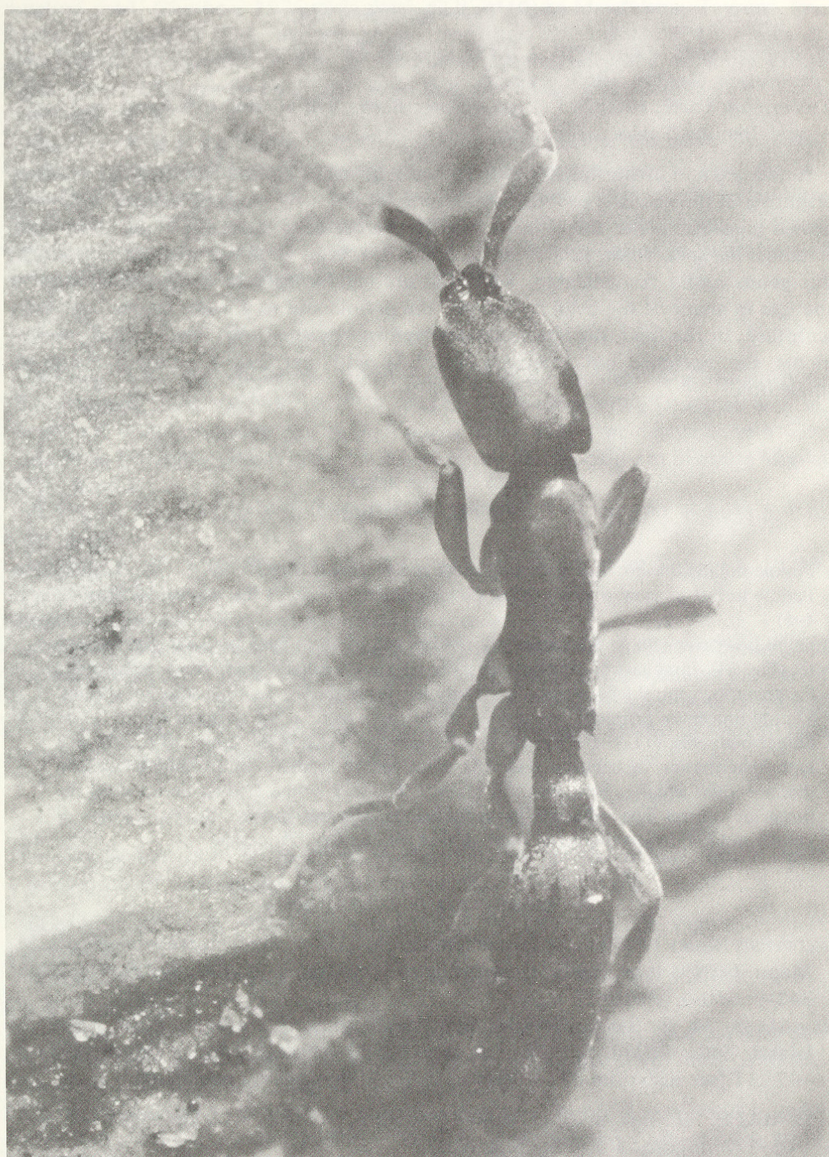
Fig. 15. Probolomyrmex brujitae , holotype. The specimen was collected alive from a Winkler bag. The stretched out antennae with hardly any angle between the scape and the funiculus are typical.