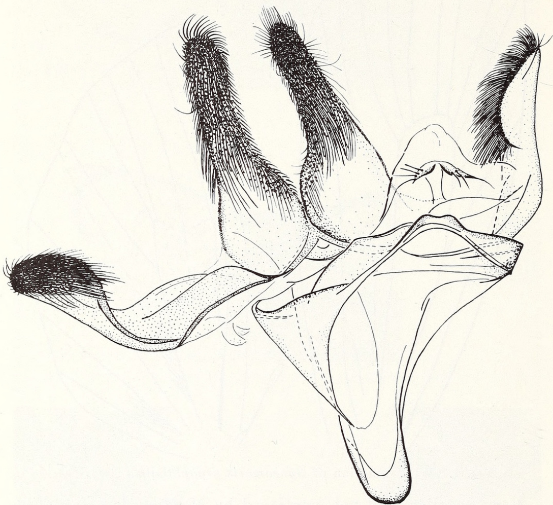
FIG. 2. Male genitalia of Syncamaris argophthalma Meyrick (type).

have another character distinguishing them from the remaining Copromorphidae, namely an obtuse terminal joint of the labial palpi, and perhaps deserve separation as a new family. It is, however, untimely to establish this family for three genera, since Copromorphidae include also many other genera of unascertained relationship, and need a detailed and careful revision. Until this revision is done, it seems better to place the genus Syncamaris in the family Copromorphidae.