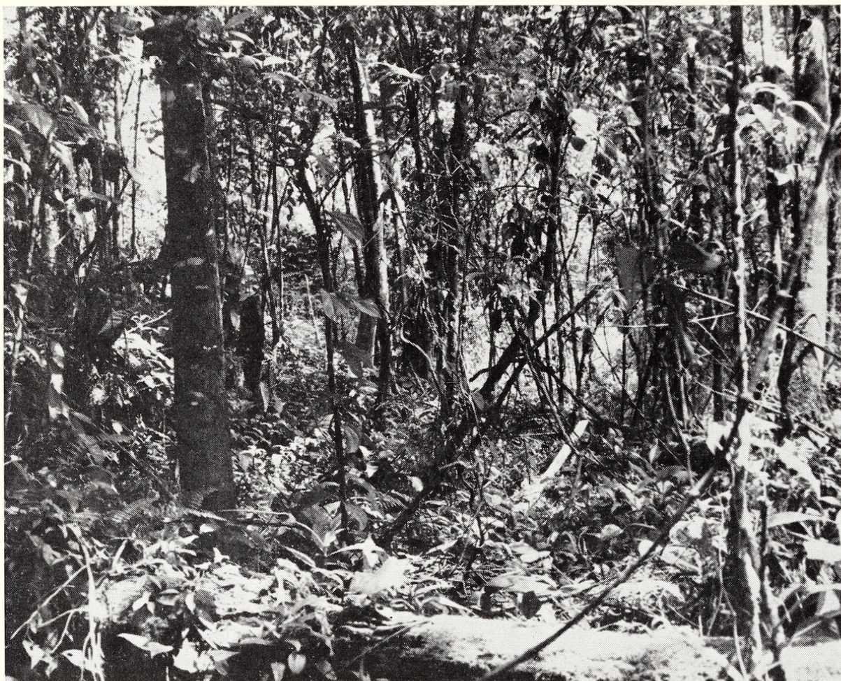
FIG. 2. The thinned-out old secondary forest habitat at the edge of transitional-zone rain forest at Finca Tirimbina where female P. dido dido oviposits on Passiflora vitifolia (Passifloraceae) vines that grow along the ground and over rocks and tree stumps.

The pupa for Costa Rican P. dido lasts about eleven days for the male and twelve or thirteen days in the female. Beebe et al. do not give a typical duration figure for the pupal stage.