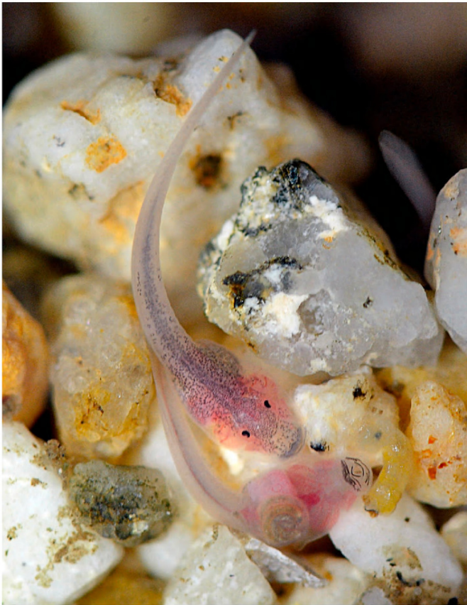
Figure 7. Tadpoles of Staurois parvus .

The diversely structured artificial habitat in the breeding tank offered individuals similar conditions as observed in the natural habitat. Earlier studies that kept adults of S. parvus in terrariums of simpler design (no flowing water) showed that individuals did not display acoustic or visual signals under such conditions (R. Kasah, pers. comm.). At the beginning of our project we kept individuals pair-wise in simpler terraria with a small water area containing no gravel and only larger pebbles, some tree branches, flowing water via a pump, and temperatures of 23-25 °C. Under these conditions individuals performed advertisement calls and foot-flagging behavior but no reproductive behavior could be observed. Especially in S. guttatus females displayed territorial calls and foot flags if males approached, a behavior that was interpreted as a spacing mechanism (Preininger et al., data not shown). After transferring all individuals in the considerably larger and diversely structured breeding tank, calling activity intensified, and pairs in amplexus could be observed after a few weeks. Hence, we suggest that first and foremost the gravel containing flowing water area was crucial for reproduction, but also the simulated dry and rainy season might have had an effect. It is now essential to alter or exclude single environmental conditions or habitat structures to determine factors necessary for reproduction. So far we have removed the artificial side pool and flushed