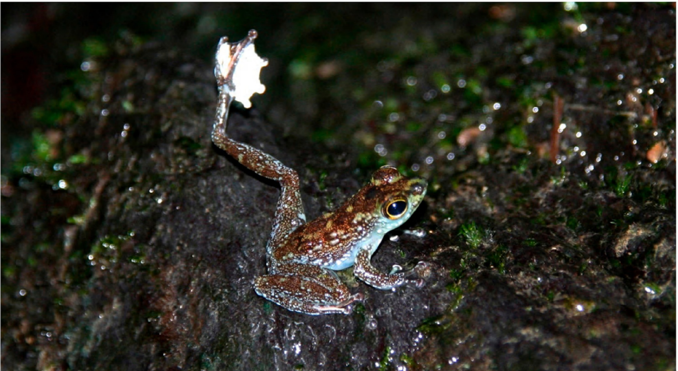
Figure 2. A male of Staurois parvus displaying the white interdigital webbing during foot-flagging behavior. The visual signals are mainly employed during male-male agonistic interactions.