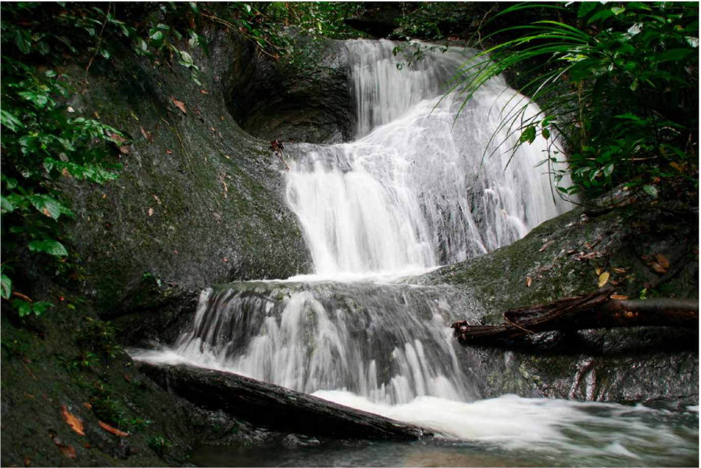
Figure 3. A waterfall habitat of Staurois guttatus at the Sungai Mata Ikan (“Fish-Eye” River) in the Temborong District in Brunei, Borneo.

Aglaonema sp., Scindapsus sp., and others) as nightly resting sites. We incorporated a self-built rain and misting system to simulate rainy and dry periods. The water area, which covered the entire floor of the terrarium, was filled with gravel of different grain sizes and larger pebbles that provided perching sites and interstitial spaces. We further installed two smaller glass containers (30 × 30 × 30 cm), one placed directly under the waterfall mimicking a constantly flushed pool with large stones, and the other containing sand, dead leaves, and standing water, as found in side ponds of waterfalls. A mixture of osmosis-purified water and drinking water (average conductivity = 9 µS/cm, pH = 7.2) was discharged via the waterfall and drained into an external filter reservoir, which created a slow current in the main water area. As light source we used a metal-halide lamp (HIT-DE 70 Watt [Daylight]) and placed several plastic boards on top of the terrarium to mimic canopy coverage. Individuals were housed under 12-hour light, 12-hour dark cycles. We placed five pairs of S. parvus into the arena. From then on individuals could only be counted at night when perching on leaves, while frogs rested in the many hiding places during the day.