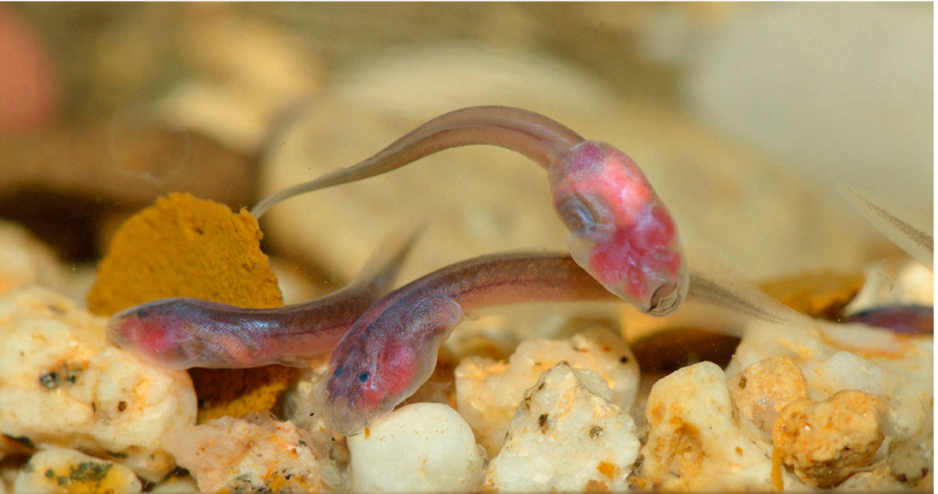
Figure 11. Tadpoles of Staurois guttatus .