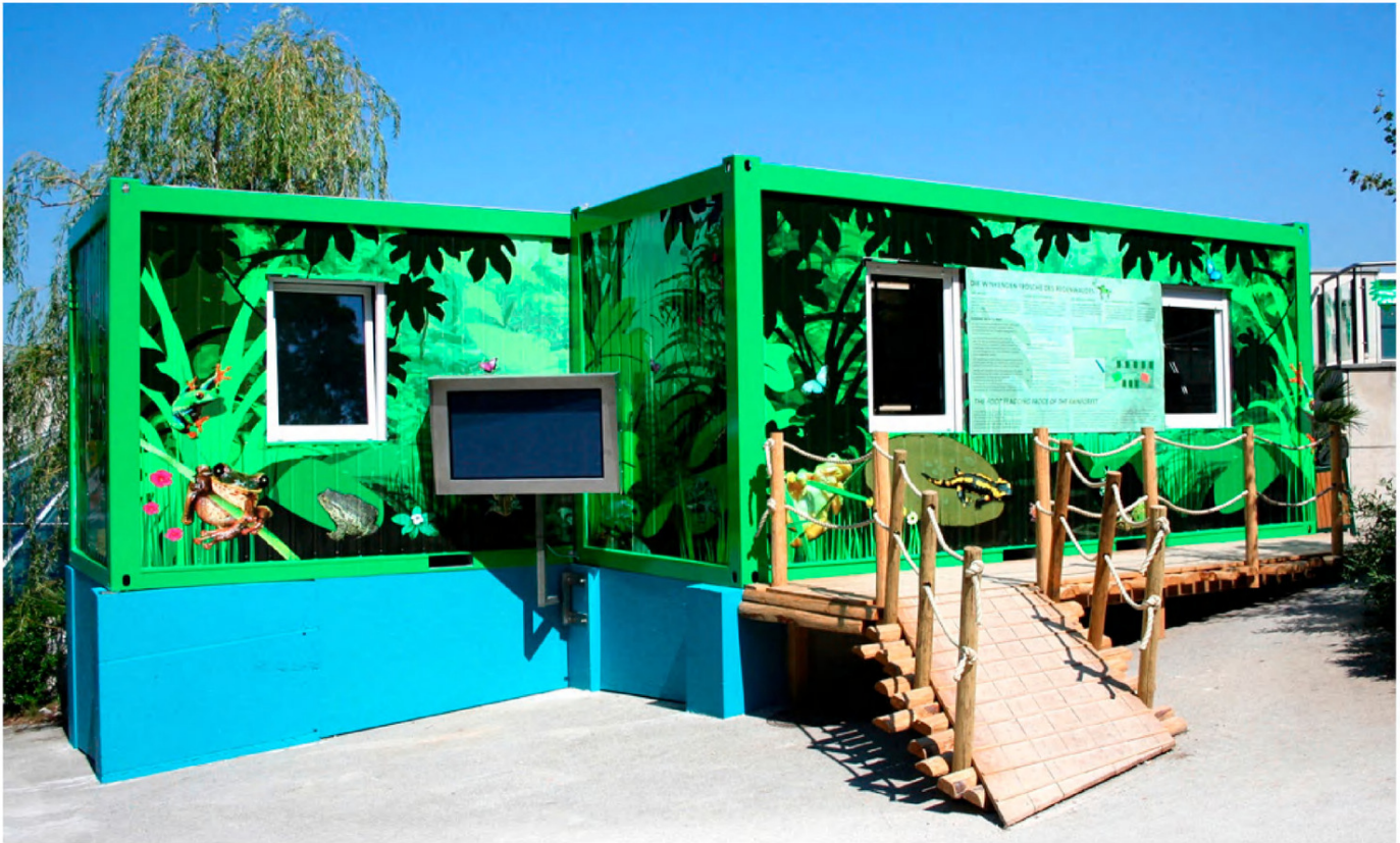
Figure 4. The bio-secure container facility a modern Noah's Ark, which houses Staurois guttatus and S. parvus at the Vienna Zoo Schönbrunn.