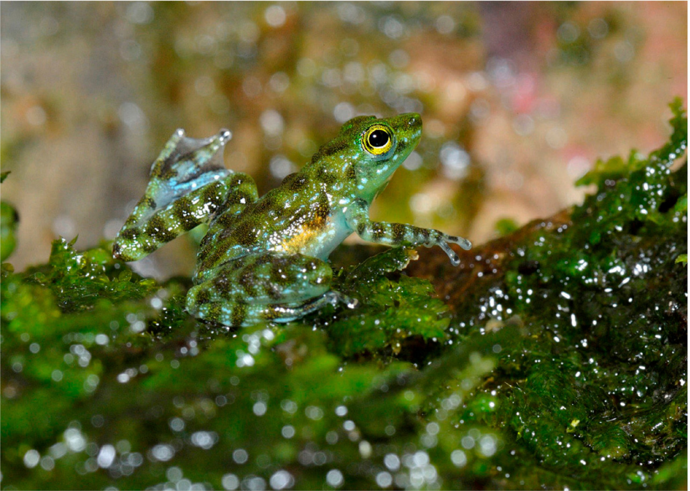
Figure 10. Juvenile Staurois parvus performing a foot-flagging behavior. Interdigital webbing are transparent grey and not white as observed in adults (see also Fig. 2).