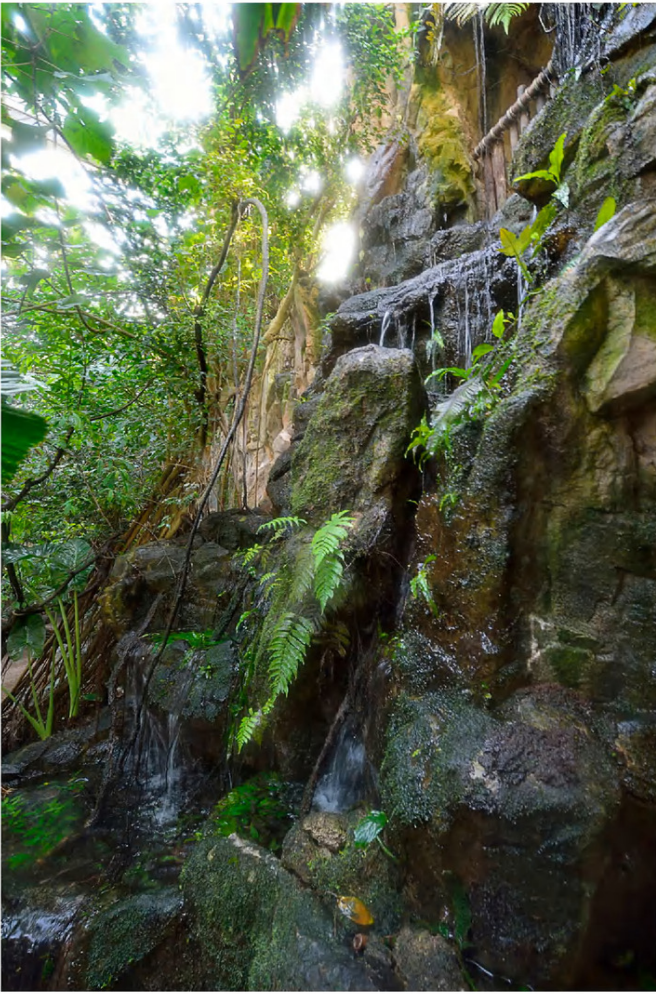
Figure 9. Artificial waterfall habitat at the Borneo Rainforest-house in the Vienna Zoo.

pool from the S. parvus breeding terrarium and still observe freshly hatched tadpoles.