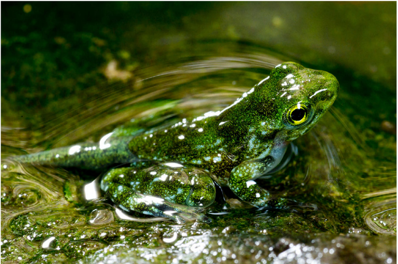
Figure 8. Juvenile Staurois parvus .

The diversely structured artificial habitat in the breeding tank offered individuals similar conditions as observed in the natural habitat. Earlier studies that kept adults of S. parvus in terrariums of simpler design (no flowing water) showed that individuals did not display acoustic or visual signals under such conditions (R. Kasah, pers. comm.). At the beginning of our project we kept individuals pair-wise in simpler terraria with a small water area containing no gravel and only larger pebbles, some tree branches, flowing water via a pump, and temperatures of 23-25 °C. Under these conditions individuals performed advertisement calls and foot-flagging behavior but no reproductive behavior could be observed. Especially in S. guttatus females displayed territorial calls and foot flags if males approached, a behavior that was interpreted as a spacing mechanism (Preininger et al., data not shown). After transferring all individuals in the considerably larger and diversely structured breeding tank, calling activity intensified, and pairs in amplexus could be observed after a few weeks. Hence, we suggest that first and foremost the gravel containing flowing water area was crucial for reproduction, but also the simulated dry and rainy season might have had an effect. It is now essential to alter or exclude single environmental conditions or habitat structures to determine factors necessary for reproduction. So far we have removed the artificial side pool and flushed