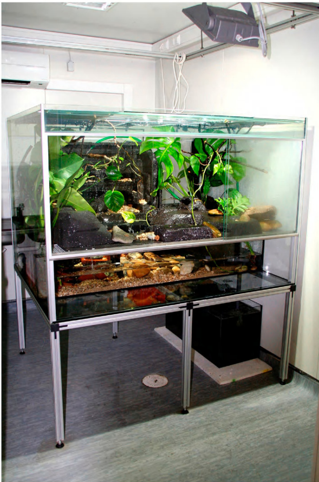
Figure 5. Ex situ breeding facility designed to offer different egg deposition sites (described in detail in the Methods section).