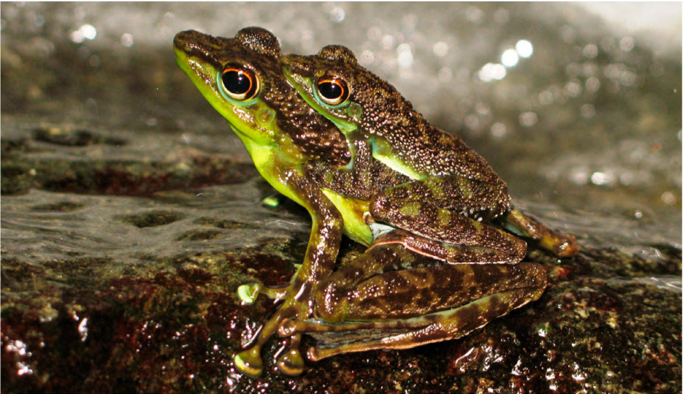
Figure 1. Male and female Staurois guttatus in amplexus resting at a waterfall.

Many stream living anuran species in Borneo show morphological and behavioral adaptations to torrential streams and waterfalls. For example, the tadpoles of Huia cavitympanum and of all species of the genus Meristogenys have large abdominal suckers specialized for a life in currents (Haas and Das 2012). The adult males of M. orphnocnemis use high frequency calls to communicate in noisy stream environments (Boeckle et al. 2009; Preininger et al. 2007). An extraordinary spectral adaptation to enhance the signal-to-noise ratio has also been reported in Huia cavitympanum , in which males call in a band of ultrasonic frequencies (Arch et al. 2008). In the vicinity of waterfalls and fast-flowing streams, species of the genus Staurois display an exceptional behavior termed, “foot-flagging” (Grafe et al. 2012; Grafe and Wanger 2007; Preininger et al. 2009). The conspicuous visual display mainly observed in tropical anuran species inhabiting riparian habitats (reviewed in Hödl and Amézquita 2001) may act as a complementary mode of communication in noisy habitats.