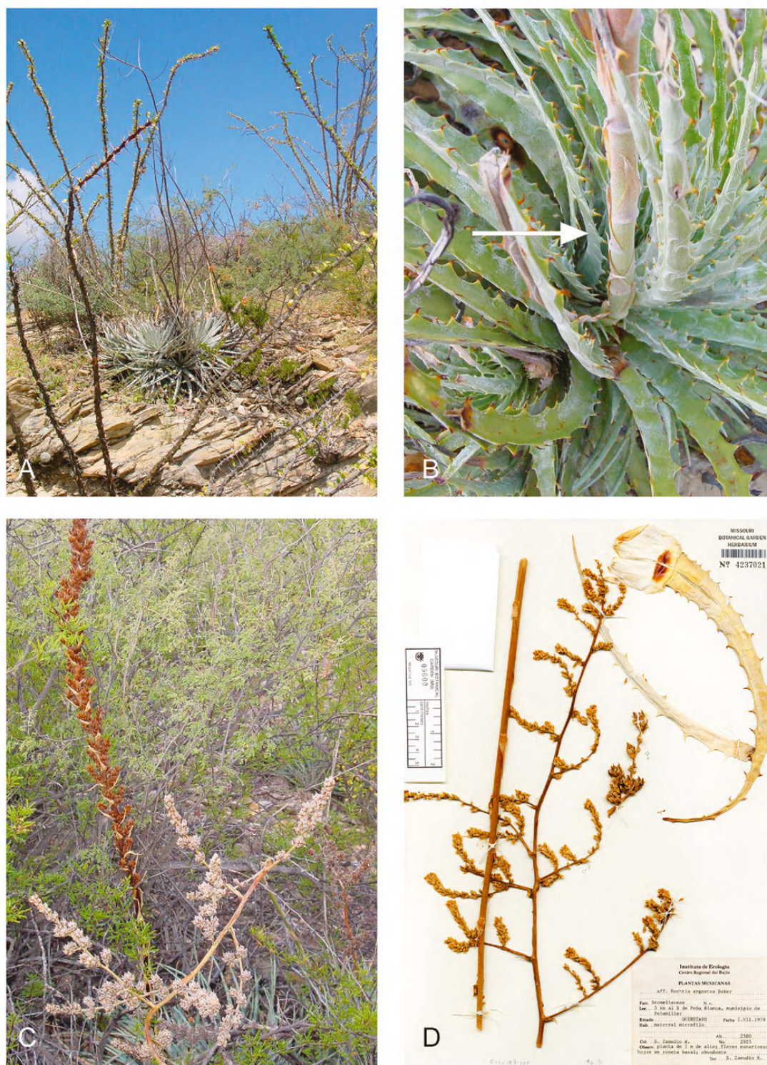
Fig. 1. A-D. Hechtia lepidophylla I. Ramírez. A. plant in habitat; B. rising of the scape, this pointed with an arrow; C. pistillate plant (at the middle), fruiting plant (far right), sympatric with a pistillate plant of Hechtia podantha (right, brown colored) in Querétaro; D. holotype (S. Zamudio 2923, MO) showing details of the curved foliar blade and staminate inflorescence structure and a fragment of a fruiting branch (photographs by I. Ramírez).