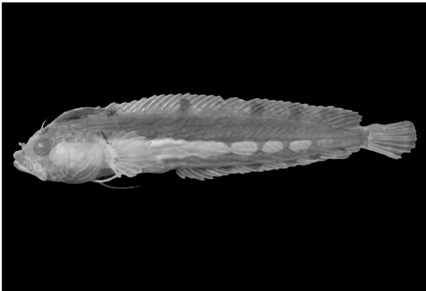
Figure 1. Holotype of Heteroclinus kuiteri AMS I.19777-009, a 44 mm SL male. Photo is of the right side and reversed to better show the fins (tip of dorsal fin hidden on left side) and allow comparison with other specimens, photographed several years after collection.