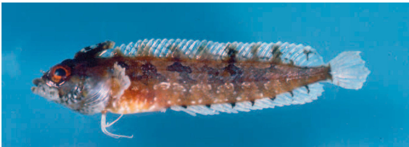
Figure 2. Male paratype of Heteroclinus kuiteri , AMS I.19777-006, 39 mm SL male, photographed a few weeks after collection.