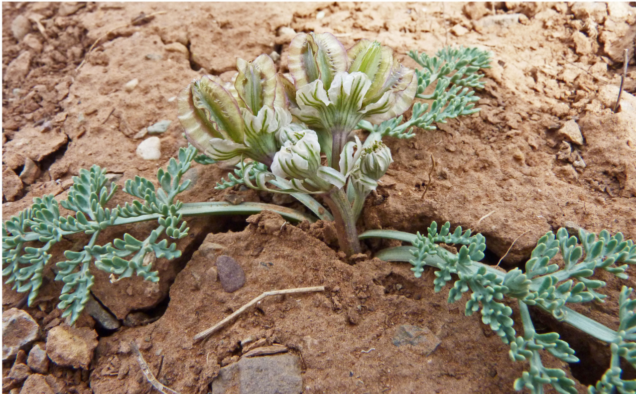
Figure 4. Vesper constancei from Dolores Co., Colorado, May 2010. Photo ©Al Schneider, www.swcoloradowildflowers.com .

The new name of the genus is from Latin, vesper , evening or west, sometimes referring to the "evening star" (usually Venus) seen at sunset in the western sky. The name alludes to the team of Sun and Downie, who have provided molecular analyses (Feng-Jie Sun and Stephen R. Downie 2004, 2010; and including Downie et al. 2002) indicating that evolutionary relationships among many of the currently and historically recognized genera of western North American Apioideae are complex, apparently reticulate.