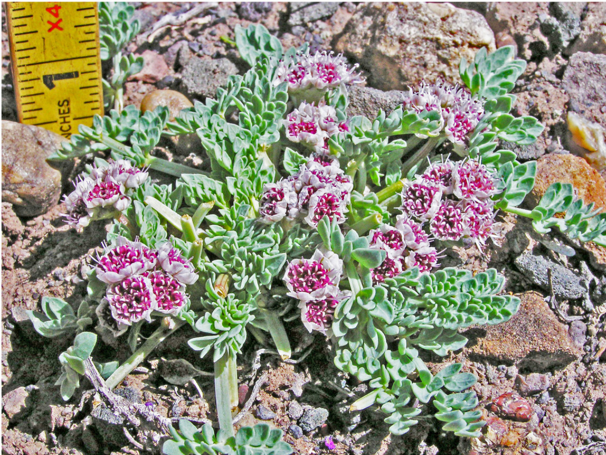
Figure 1. Vesper bulbosus from Montezuma Co., Colorado, 27 March 2005.

Distinct in its combination of thick taproots, acaulescent habit but consistent production of pseudoscapes, compact inflorescences, white to cream, pink, or purple petals, dorsally compressed mericarps with 4–5, thin, broad dorsal wings (3) and lateral wings (2) and with 3–9 oil tubes per interval, and particularly by its involucler bracts basally connate, prominently nerved, and totally white to purplish-scarious or with broad white-scarious margins. Outer umbellets of staminate flowers, inner ones of pistillate or staminate flowers in part; carpophore bifid to base or absent.