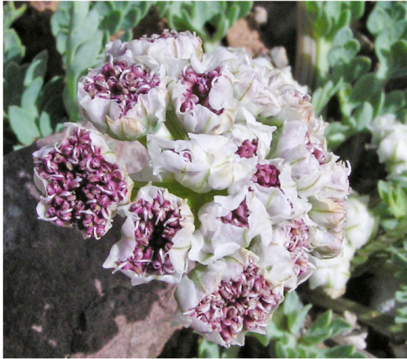
Figure 2. Vesper bulbosus . Same plant as Fig. 1.