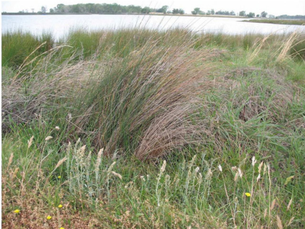
Figure 3. Gamochaeta argyrinea at Thermalito Afterbay site, 17 May 2012.

Centunculus minimus , Crucianella angustifolia , Eleocharis macrostachya , Galium tricornutum , Gastridium phleoides , Gastridium ventricosum , Juncus acuminatus , Lathyrus angulatus , Plagiobothrys stipitatus , Plantago coronopus , Plantago virginica , Pseudognaphalium stramineum , Ranunculus pusillus , Rorippa curvisiliqua , Trifolium cernuum , Trifolium dubium , and Triodanis biflora . Records for these collections are from the Consortium of California Herbaria (2012).