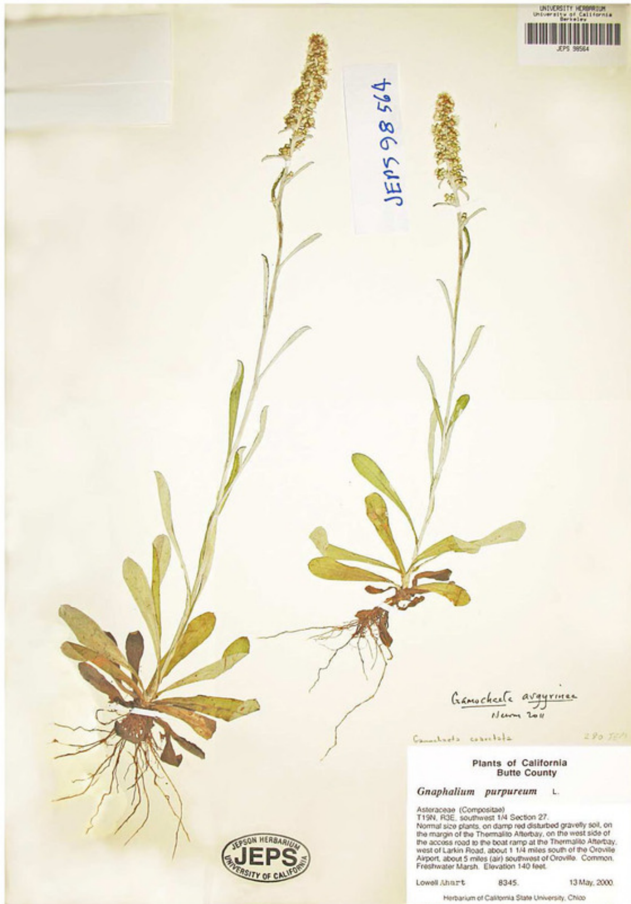
Figure 2. Gamochaeta argyrinea from Butte County (JEPS), margin of the Thermalito Afterbay, 13 May 2000.