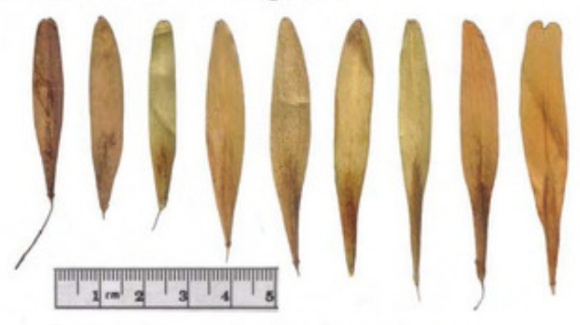
Figure 1. Samara variation in Fraxinus profunda.