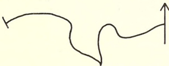
TEXT-FIG. 2. Suture of Cymaclymenia borahensis sp. nov.

Description . The conch is moderately involute, less so in younger whorls, and platyconic. The whorl height increases markedly in later volutions. The maximum number of