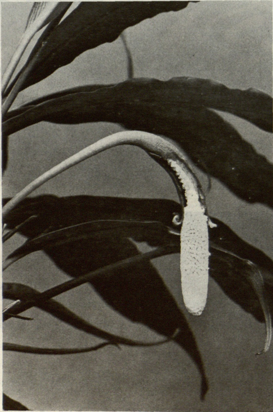
Pl. 3. — Hottarum sarikeense Bogner & Hotta : Inflorescence with the lower part of the spathe only and this partly removed, showing the female part of the spadix too \times 1.6 ; phot. J. BOGNER. From Bogner 1553.

tip. Spadix 3-3.5 cm long; upper part ca. 0.5 cm in diameter, yellowish; the female part of the spadix 1-1.2 cm long and ca. 3 mm in diameter, adnate at the spathe on its whole length; then followings 2 or more rows of sterile male flowers, part with the fertile male flowers about 1 cm long, followed by sterile male flowers on the top of ca. 0.5 cm length. Flowers unisexual, naked. Female flowers with a staminode present at the base and along the two sides of the female part of the spadix, but the female flowers in the middle always without a staminode; staminode whitish, ca. 1.2 mm long, subcapitate, as long or longer than the pistils; ovary more or less globular, sometimes a little squeezed, ca. 1 mm in diameter, whitish, unilocular; placentation basal; ovules hemiorthotropous, ca. 0.4 mm long; stigma discoid, sessile, papillose, ca. 0.4 mm in diameter, yellowish-