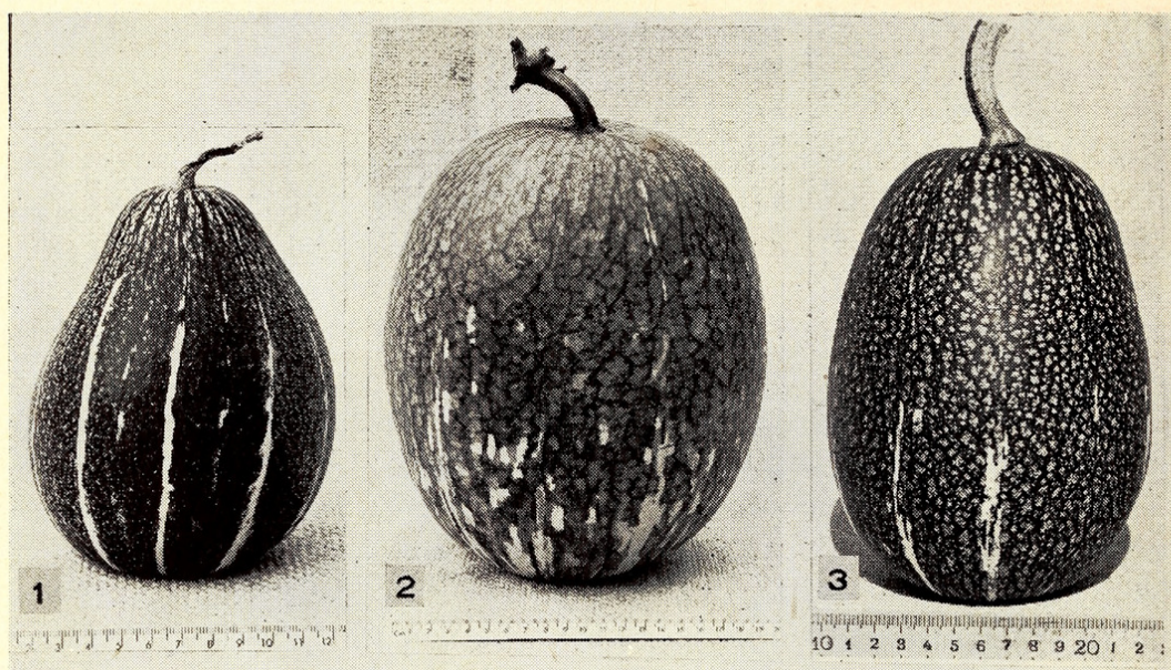
FIGS. 1-3. Mature fruits. FIG. 1. Cucurbita andreana . FIG. 2. Cucurbita ficifolia . FIG. 3. F_1 ( C. andreana \times C. ficifolia ).

Cucurbita it is important to learn something about the genetics of the perennial habit, as it may help in understanding the intricate relationships between the cultivated and the wild species.