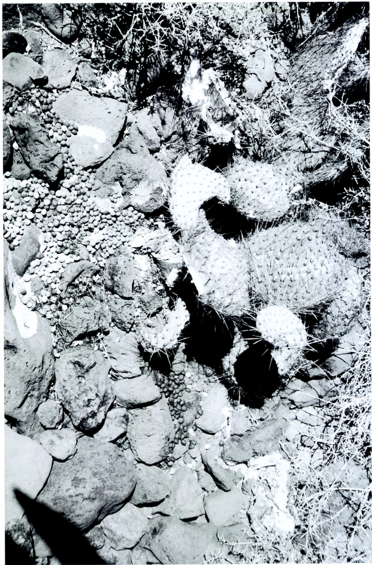
FIG. 2. Clades of Opuntia taponia showing damage. Note goat and jackrabbit pellets on ground.