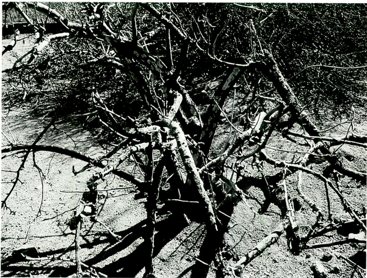
FIG. 3. An exemplar of Jatropha cinerea showing damage by goats, note bark stripping and broken branches.