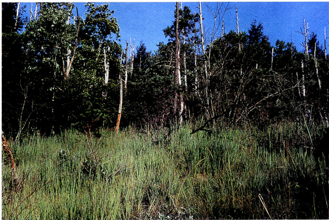
FIG. 3. Buck Creek serpentine woodland in mid August. The dominant grass is Andropogon gerardii .