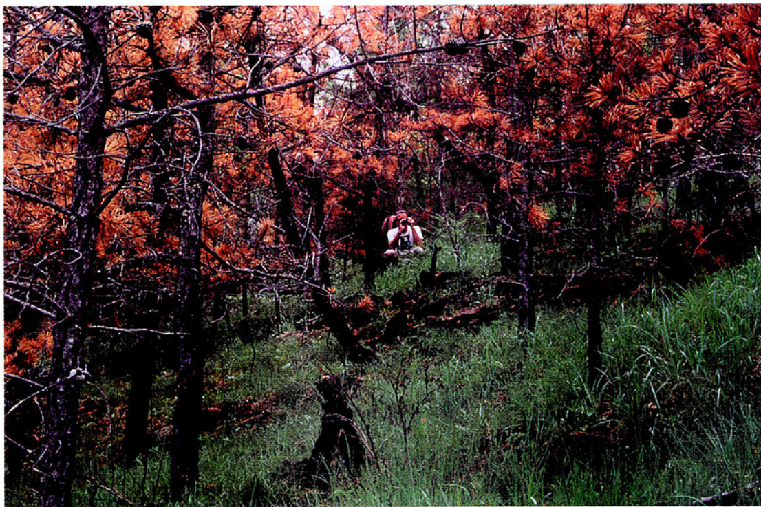
FIG. 4. Emerging grasses at Buck Creek serpentine woodland 3 weeks following a prescribed burn designed to reduce the canopy layer. Prescribed fire was conducted in April of 1995.