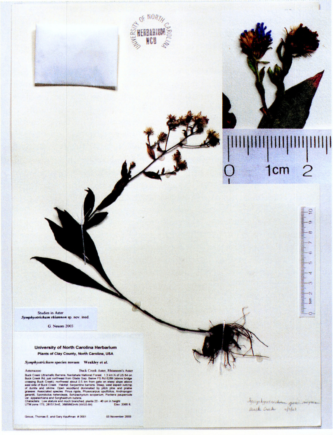
FIG. 1. Symphyotrichum rhiannon : A. Holotype; B. Closeup of capitulum (isotype).