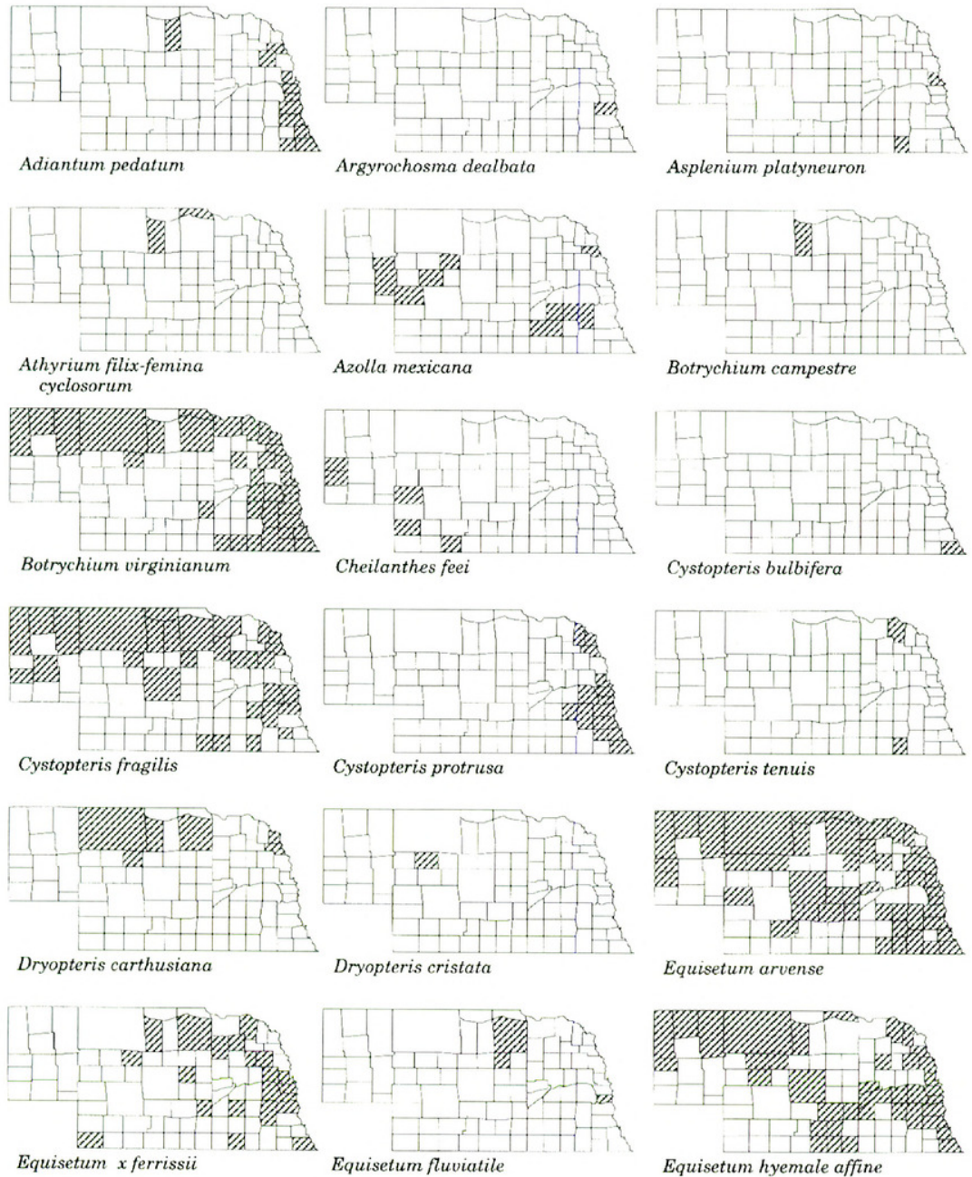
FIG. 2. Distribution maps of all Nebraska species of ferns and fern allies, as collected from 1873 through 2001. The records for each shaded county are supported by at least one voucher specimen deposited in an herbarium cited in this paper.

though correctly identified, the specimen was rejected by Brooks (1978) because the mosses with the specimen are not native to Nebraska, and Petrik-Ott (1979), in the addendum to her book, agreed. Neither this nor any other species of Lycopodium , sensu lato , is known in Nebraska.