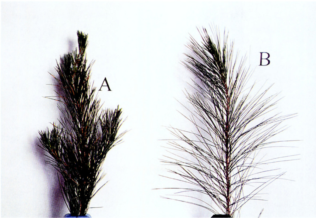
FIG. 2. A comparison of leaf characteristics of (A) Pinus greggii var. greggii from La Tapon, Nuevo Leon, and (B) Pinus greggii var. australis from El Madroño, Queretaro. The trees are growing in Louisiana, USA, produced from seed from the corresponding native stands in Mexico.