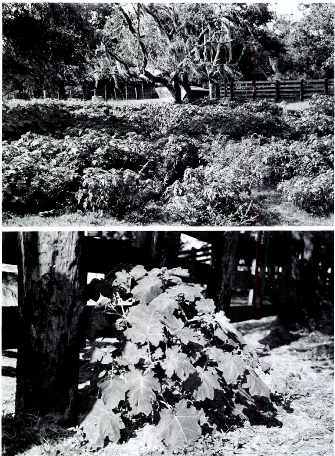
FIG. 1. Solanum viarum Dunal. Top: large population in cow yard (Hardee Co., Florida). Bottom: habit.

Specimens examined. FLORIDA. Desoto Co.: 0.5 mi E of Ft. Ogden, E of FLA 17 on FLA 761, 1 Oct 1992, DeLaney 1921 (USF). Glades Co.: N side of US 27, 2 mi W of FLA 720, ca 4 mi W of the Clewston K-Mart, T43S, R33E, Sect. 11, 7 Jan 1988, Orsenigo s.n. (FLAS); N side of US 27, 2 mi W of FLA 720, ca 4 mi W of the Clewston K-Mart, T43S, R33E, Sect. 11, 8 Mar