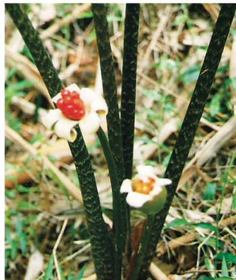
FIG 3. Close-up view of infructescence.

Alocasia nycteris Medecilo, Yao & Madulid, sp. nov. (Figs. 1–3). TYPE: PHILIPPINES: Nabas, Aklan, Panay Island, 11°54'18"N and 121°59'43"E, 3 Nov 2005, Medecilo 397 (HOLOTYPE: PNH; ISOTYPES: DLSU, DLSU-D).