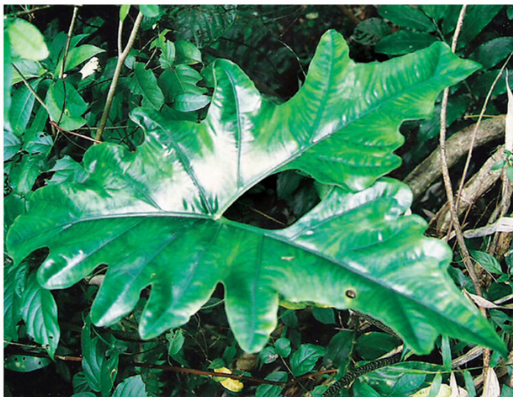
FIG 2. Close-up view of leaf showing the widely sagittate and deeply undulate to subpinnatifid margins.