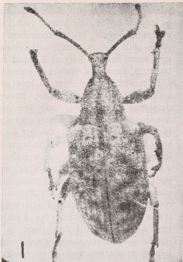
Fig. 1. Adult Indophytoscaphus sensarmai sp. nov.