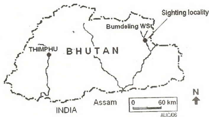
Fig. 1: Map of Bhutan showing the locality of sighting

On January 18, 2006, I left Trashigang town (in Bhutan) before dawn and drove towards Bumdeling Wildlife Sanctuary to catch up with the roosting Black-necked Cranes Grus nigricollis that take off early in the morning. While returning, we noticed a large bird perched on a tree by the