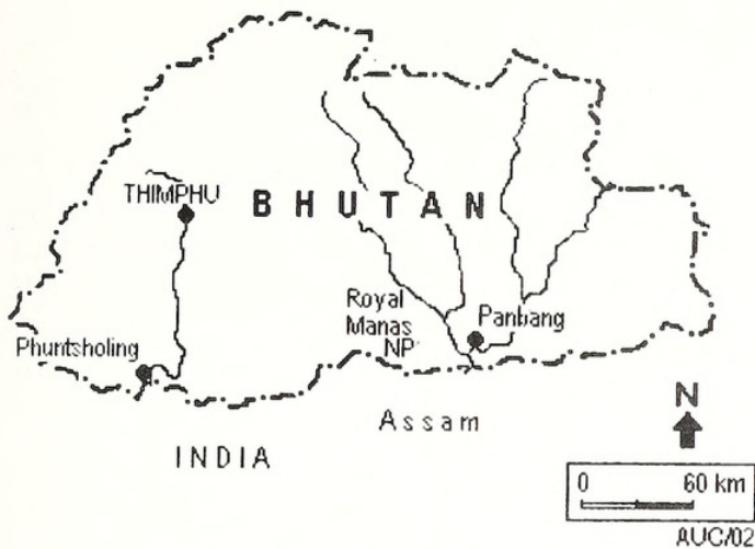
Fig. 1: Map of Bhutan

shouted, and I could see one goral a few metres from the previous day's site. It was on the cliff that was covered by