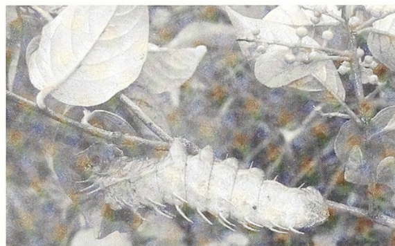
Fig. 1: Final instar caterpillar of Attacus atlas feeding on the leaves of Embelia acutipetalum

Atlas moth Attacus atlas Linnaeus of Family Saturniidae is commonly seen in monsoon in Konkan region. On July 25, 2008, I found five final instar caterpillars of Atlas moth Attacus atlas Linnaeus near a small village Kasba, Taluka Sangameshwar, District Ratnagiri. Caterpillars were 110 mm long. All caterpillars were feeding on leaves of Embelia acutipetalum (Family Myrsinaceae), a common plant in Konkan (Fig. 1). Local Marathi name of this plant is 'Vavding'. Many food plants of Atlas moth Attacus atlas Linnaeus are known, but there is no reference of this plant and is being reported here as the first record.