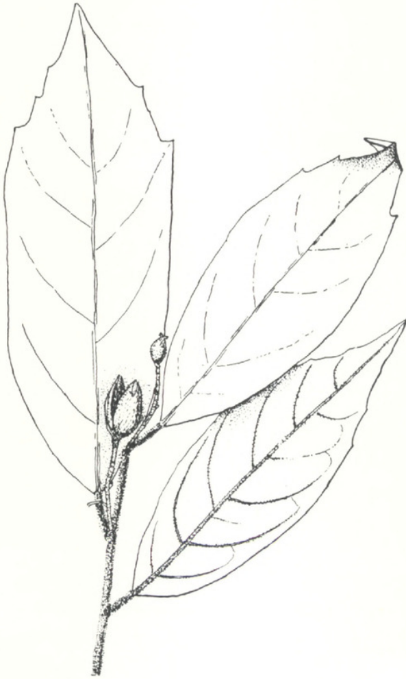
FIG. 2. Distylium Tsiangii , drawn from the type, \times \frac{1}{2} .