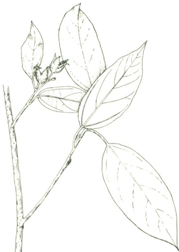
FIG. 4. Sycopsis laurifolia , drawn from an isotype (A), \times \frac{1}{2} .

acuminate at apex, acute to obtuse at base, 6 to 10 cm. long, 2.5 to 4.5 cm. wide, entire, glabrous above, much paler and finely and densely velutinous beneath, the lateral nerves 4 or 5 pairs conspicuous beneath, the lower pair sometimes longer and more acutely diverging from the midrib than the others, none prominently anastomosing, connected by rather conspicuous scalariform tertiary nerves. Flowers in spikes or racemes not distinctly subglomerate and enclosed in involucre bracts in bud, reaching 2 cm. long in fruit, the bracts 2 to 4 at base or on receptacle tube, hairy, the sepals 0 to 2, hairy. Stamens up to about 6, about 4 mm. long, the anthers apiculate, the filaments variable in length. Capsule globose, more or less pointed, about 1 cm. long, entirely enclosed in the brownish lepidote receptacle tube (always?).