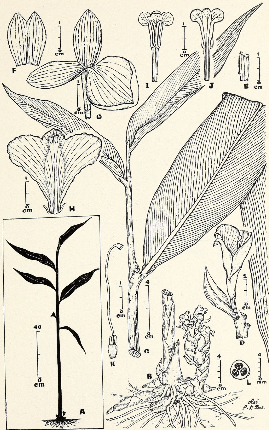
Amomum aculeatum Roxb.

Fig. A. habit; B. rootstock with rhizomes and inflorescence; C. leaves; D. flower with bract; E. bracteole; F. calyx; G. corolla; H. lip; I. stamen, inner view; J. stamen, outer view; K. ovary with style and stylodes; L. t.s. of ovary.