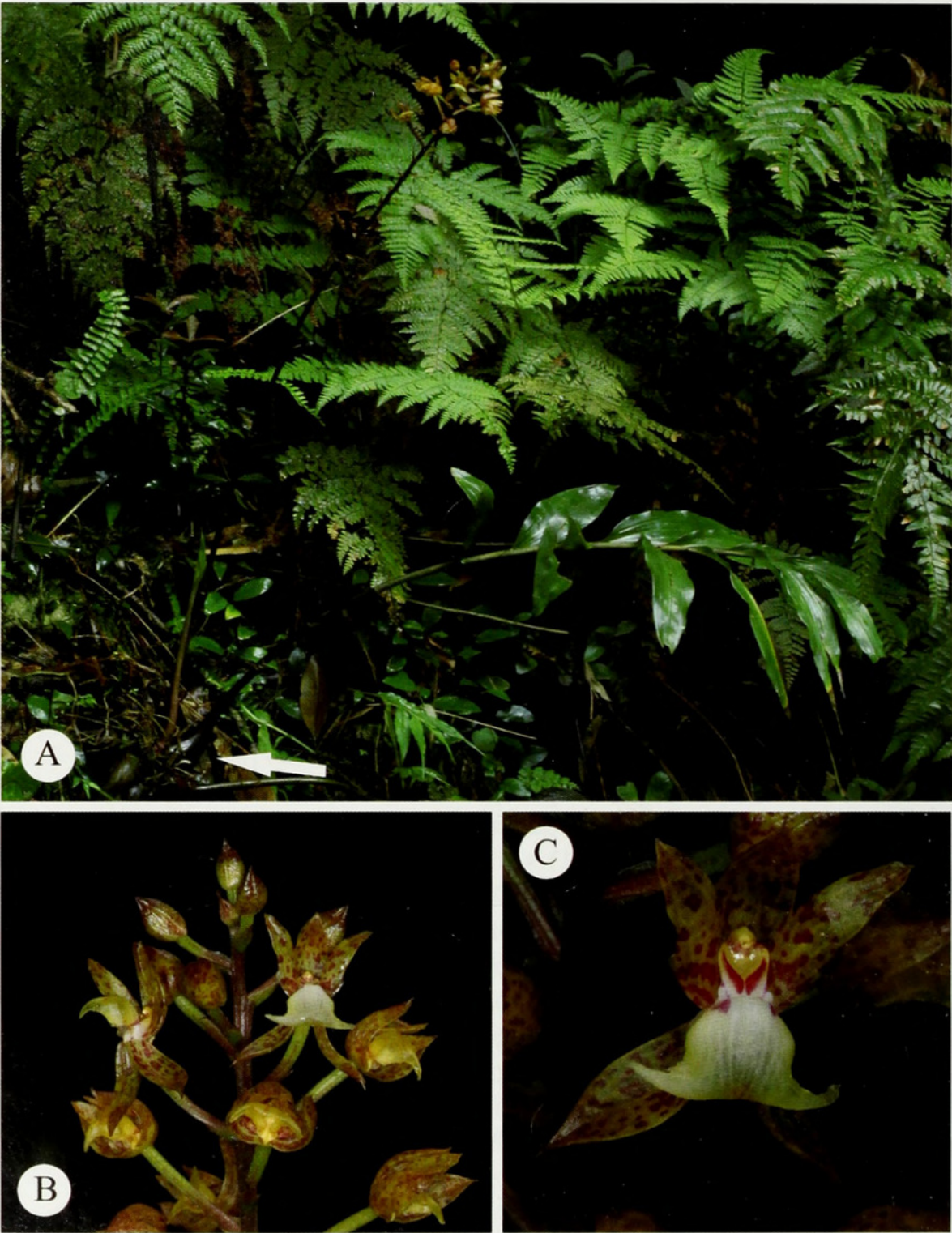
Figure 2. Plocoglottis bokorensis (Gagnep.) Seidenf. with reed-like stem (photo taken in Khao Yai National Park, Thailand). A. Plant, note the prominent pseudobulbs (arrowhead); B. Inflorescence; C. Flower. Photo: S. Chantaranorrapint (Buakhlai 70 voucher in BCU).