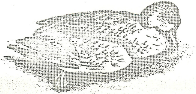
Typical attitude of duck affected by avian botulism.