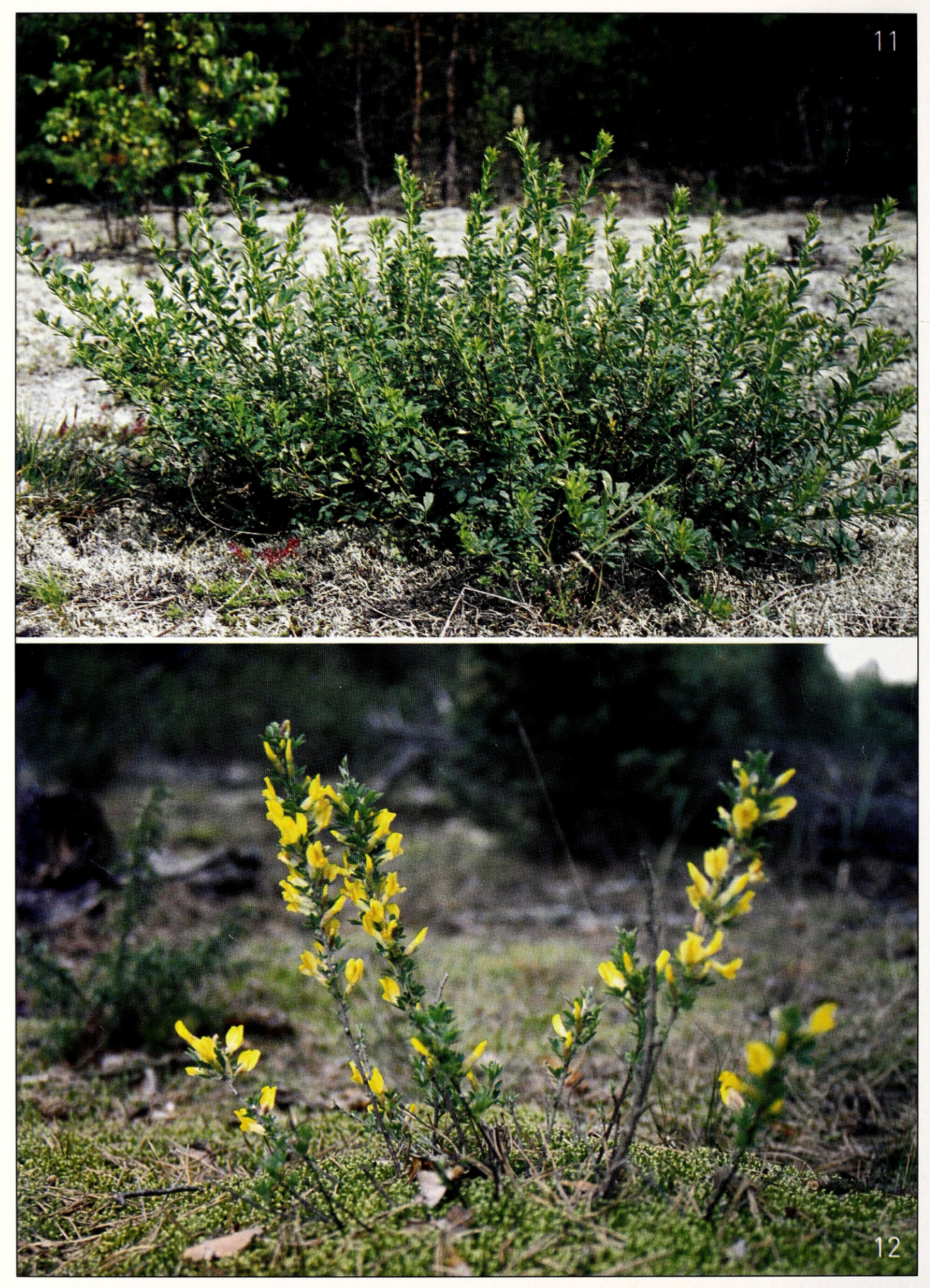
Figs. 11–12. The larval hostplant of P. eroides . 11. Chamaecytisus ruthenicus at the locality of Grzybowce in August. 12. Chamaecytisus ruthenicus at the locality of Grzybowce in May.