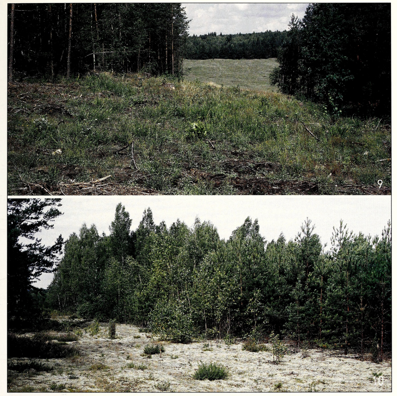
Figs. 9-10. The habitats of P. eroides. 9. The locality of Narejki. 10. The locality of Grzybowce.

Polyommatus eroides eroides (Frivaldszky, 1835) is the subspecies that occurs in Poland (Carbonell 1994). According to older data, it was very rare at several localities in the northern, central, and southern parts of the country (Romaniszyn 1929). In the Puszcza Białowieska Forest it was common in its eastern part (nowadays in Belarus) and rarer towards the west (Krzywicki 1967). Glades and edges of dry pine and coniferous forests were identified as a typical habitat for P. eroides (Krzywicki 1967). According to more recent data, P. eroides is found in Podlasie in north-eastern Poland (Buszko 2000; Buszko 1997; Klimczuk & Twerd 2000). It was also recorded in the southern part of the Puszcza Białowieska Forest and in areas to the south-east of it, towards the river Bug (Buszko 1997). Larval hostplants were not known. In 1998 P. eroides was found