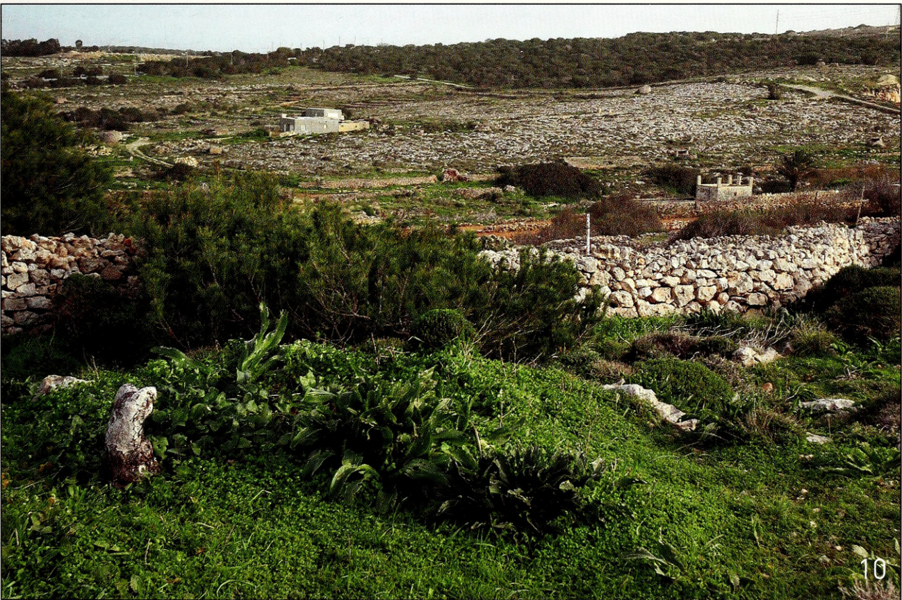
Figs. 9–10. Habitats on Malta. 9. Mdina, with shrubs of Acacia karroo . 10. Malta, Paradise Bay, Garigue with Acacia in the background.