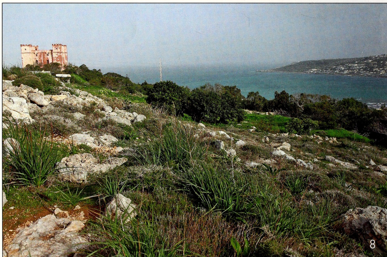
Figs. 7–8. Habitats on Malta. 7. Bahrija, Wied tal-Bahrija, with Arundo donax . 8. Mellieha, Garigue at Ghadira Bay.