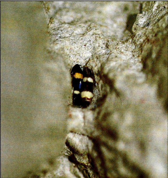
Fig. 6. Bifascioides leucomelanellus , sitting inside the light trap.