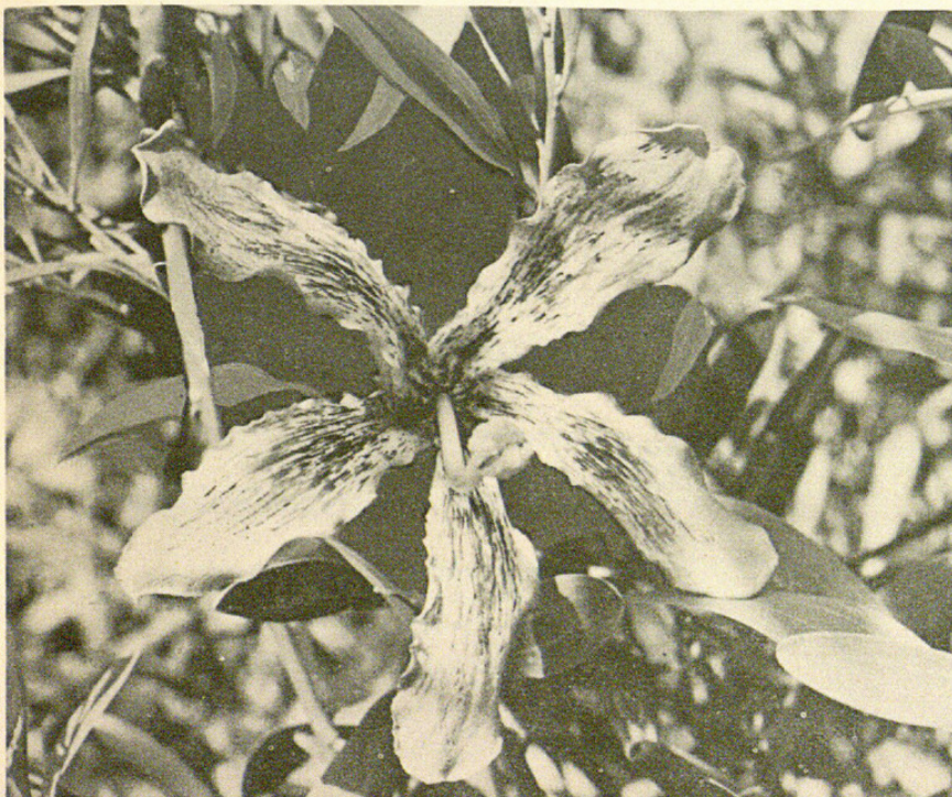
THE FLOWER OF C. SPECIOSA MEASURES 4-5 INCHES ACROSS, PALE ORCHID TO ORCHID IN COLOR. AN EXOTIC OF MUCH PROMISE FOR SOUTHERN CALIFORNIA.