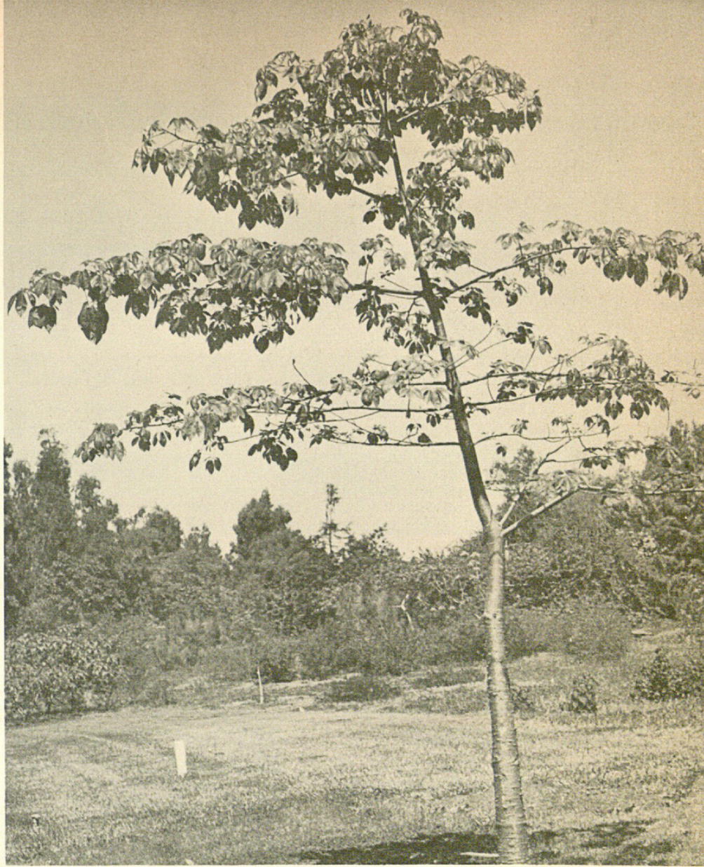
ABOVE: A YOUNG TREE OF CHORISIA SPECIOSA .... GREEN BARK, SPINY TRUNK, BRIGHT GREEN LEAVES.