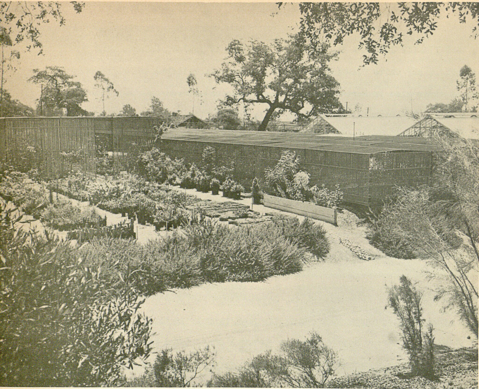
A PORTION OF THE LATHHOUSE AND NURSERY WHERE GREVILLIA LANIGERA - AN AUSTRALIAN NATIVE - IS USED AS A BORDER PLANTING....