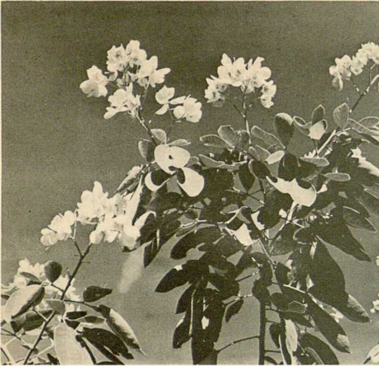
CASSIA SPLENDIDA MAKES A SHRUB-TREE IN THE SOUTH AMERICAN SECTION. THE FLOWERS ARE YELLOW-GOLD.