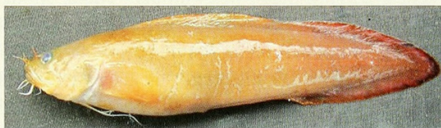
FIGURE 2. Fresh color of holotype (CAS 221531) of Brotula flaviviridis .