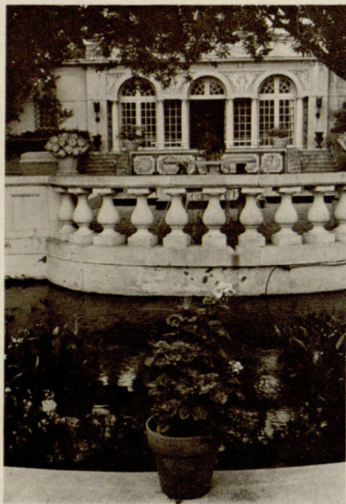
The Pool House.